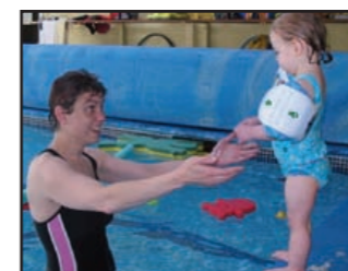
POPULAR: Water Babies sessions.

"As well as this fantastic activity we have lots of other great sessions. Chill Out Swim and Yoga gives the parents the chance to chat, relax and unwind while we look after the kids.