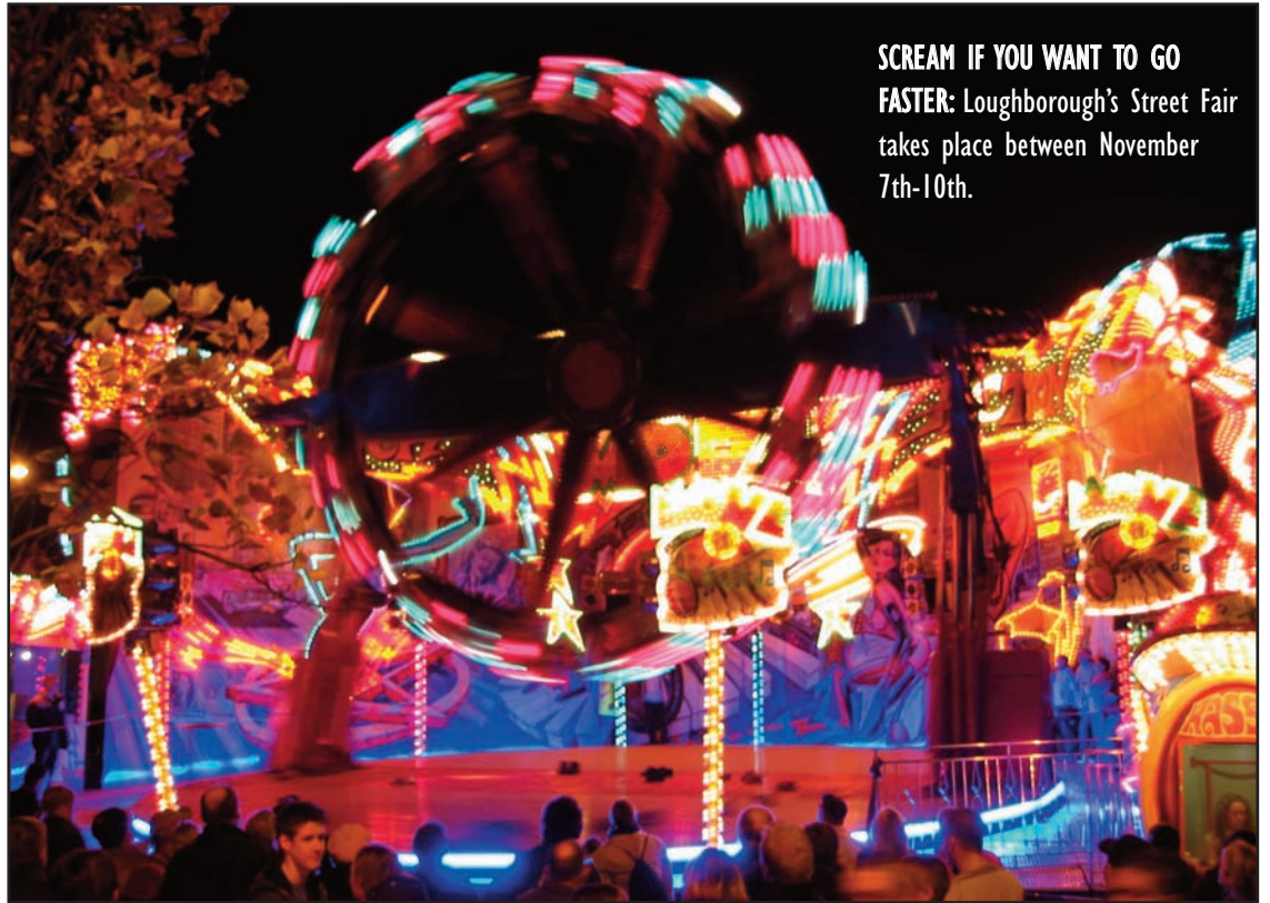
SCREAM IF YOU WANT TO GO FASTER: Loughborough's Street Fair takes place between November 7th-10th.