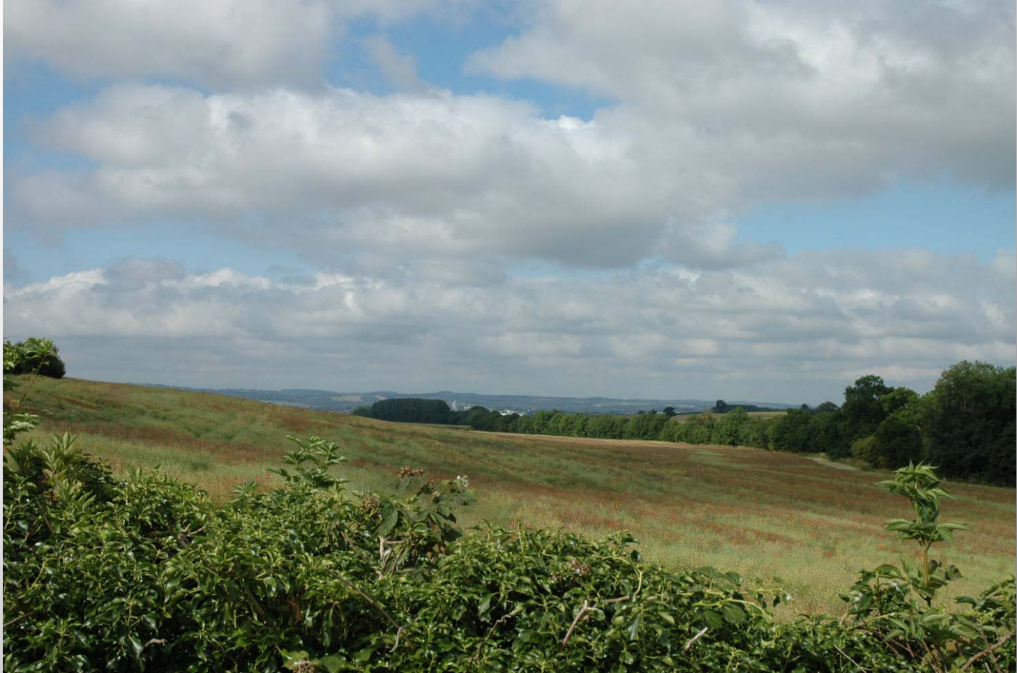
On the edge of the Wolds looking over the Soar valley