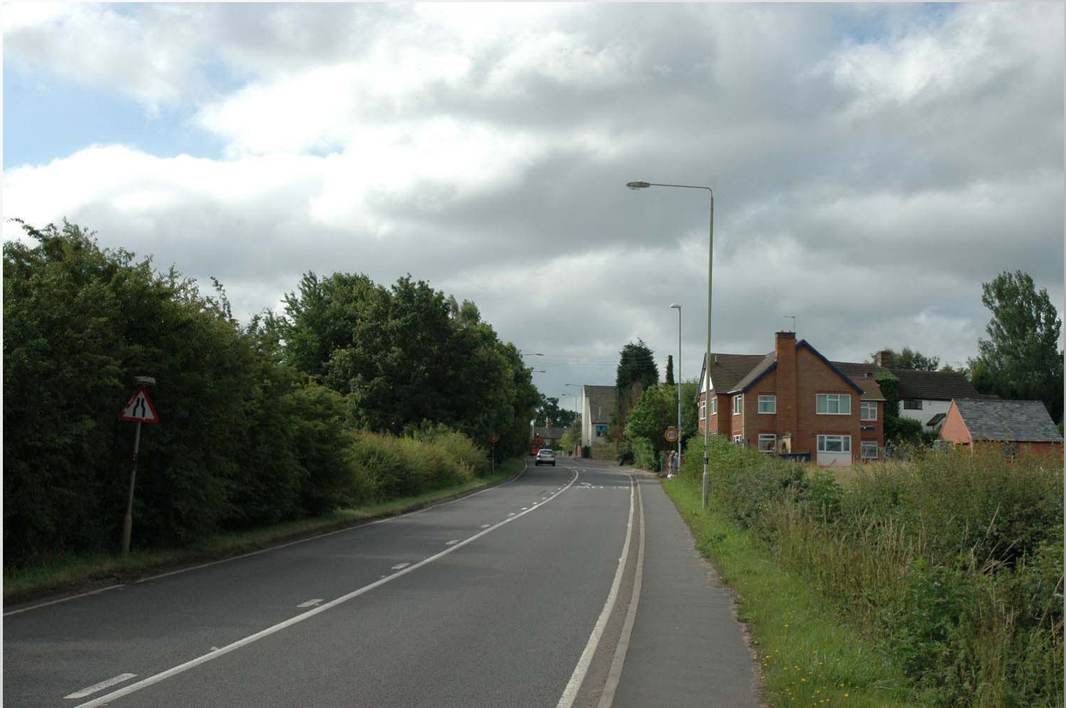
Up the hill from Rempstone