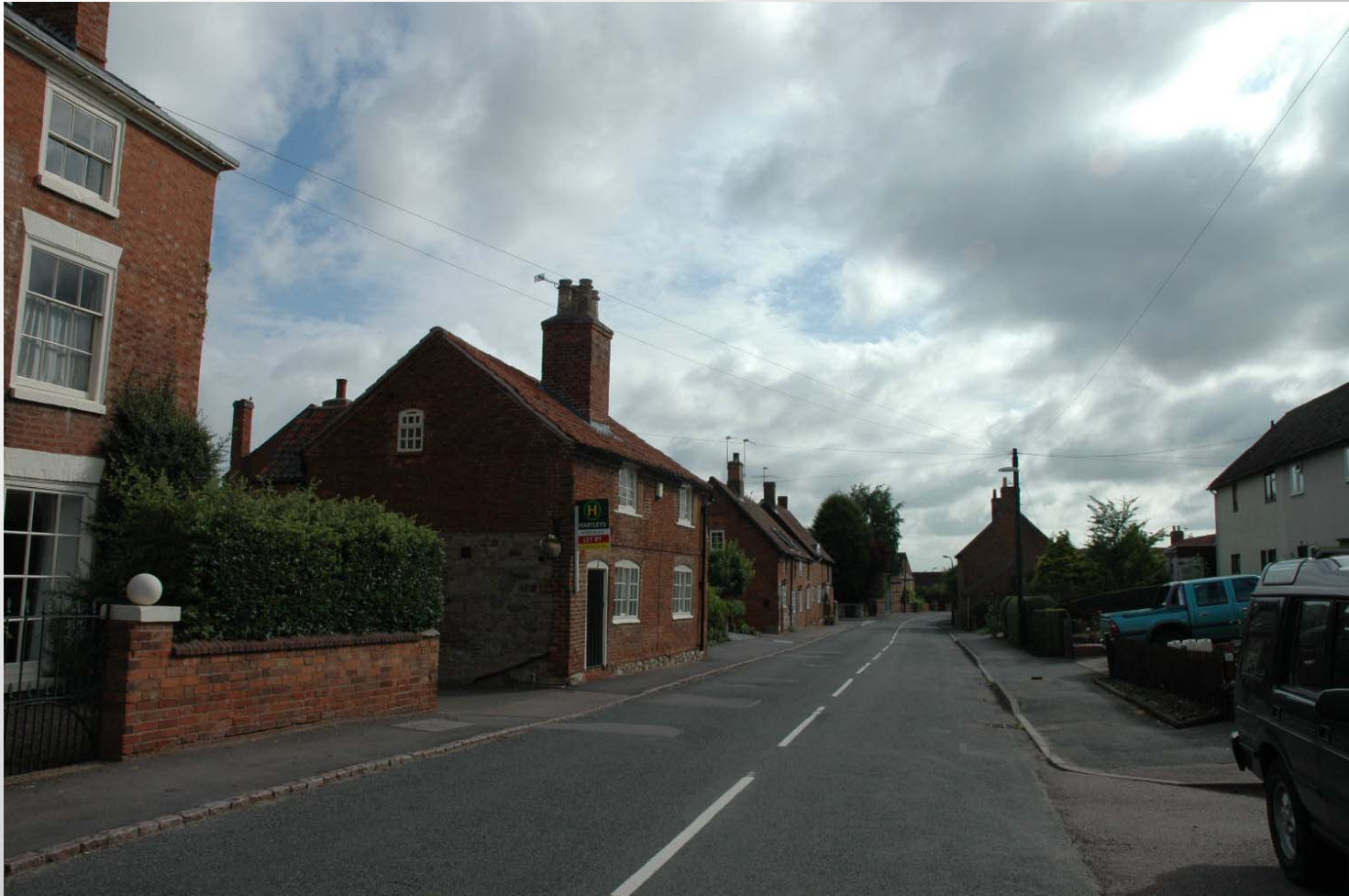
Impression of linear development