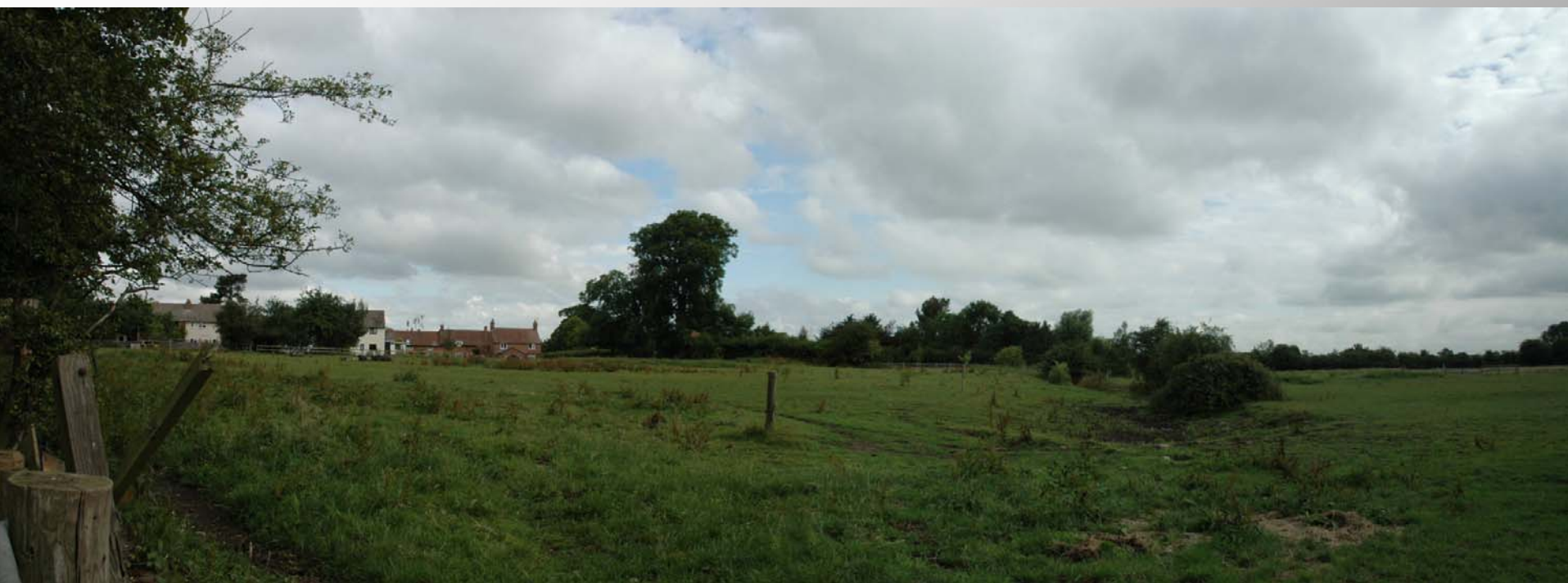
The Holloway and site of the mediaeval village