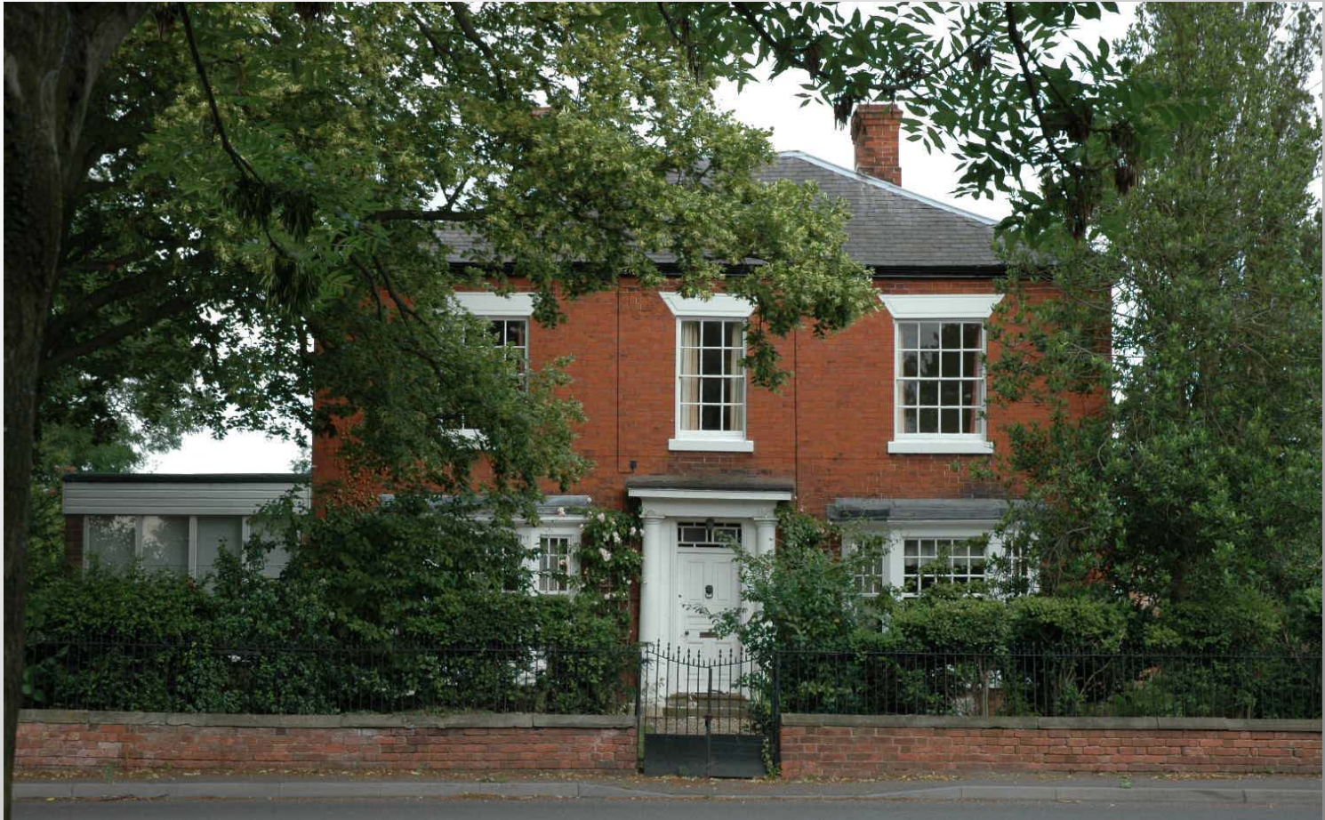
Fine Georgian Houses