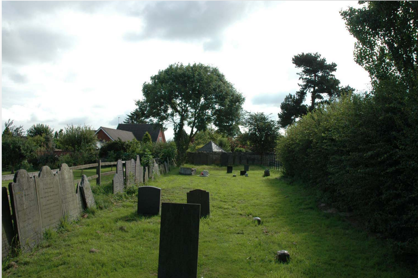
Trees and Green Spaces