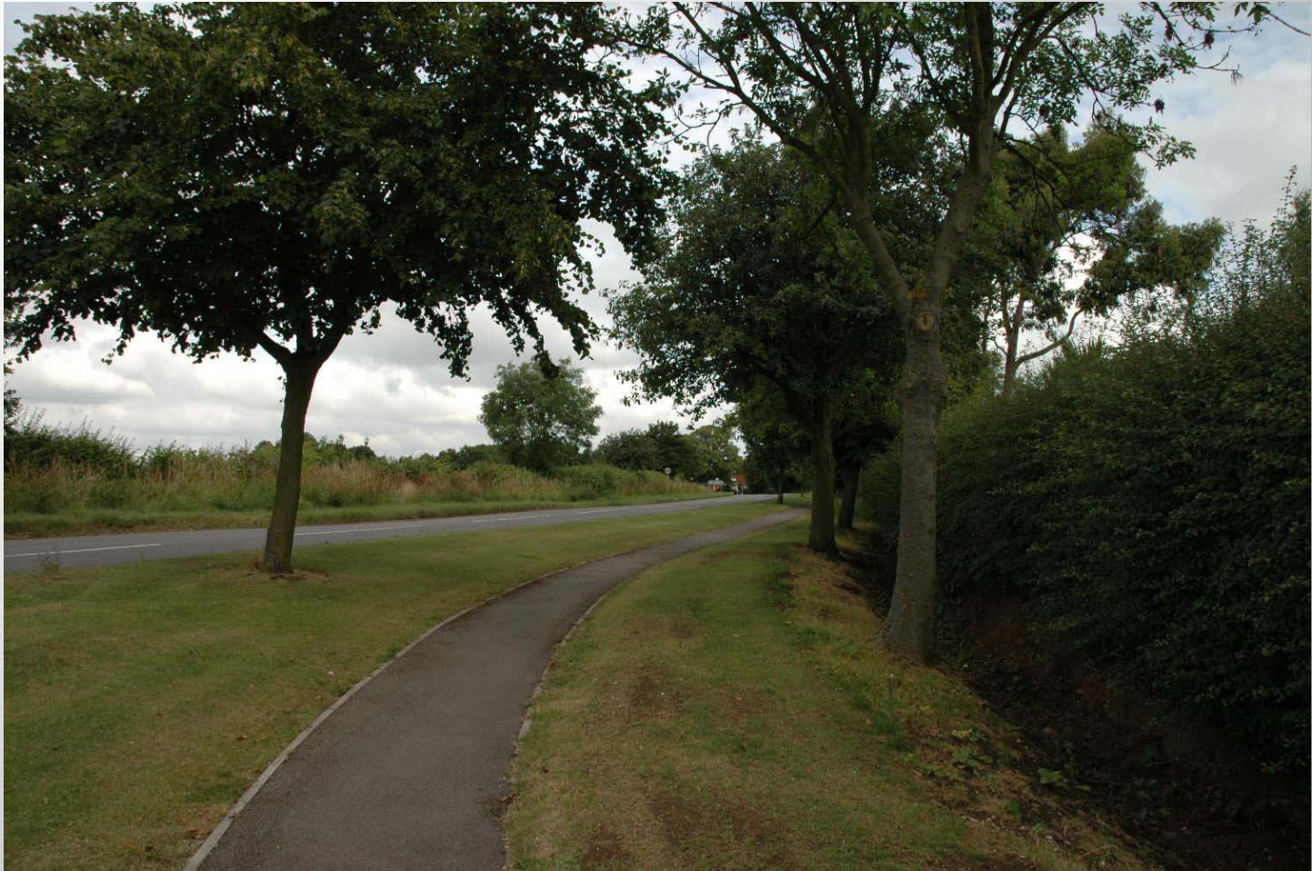
Trees and Green Spaces