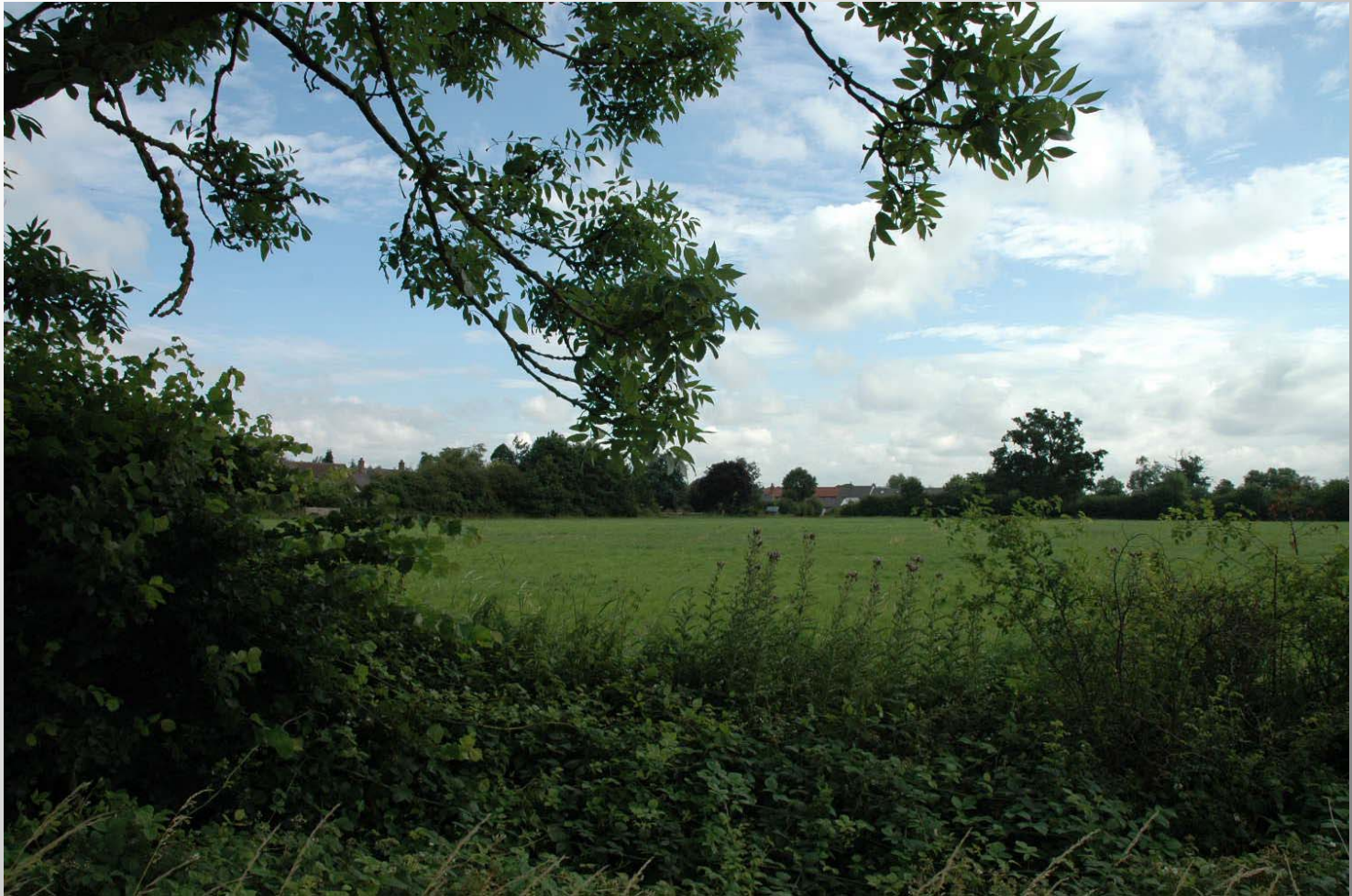
Trees and Green Spaces