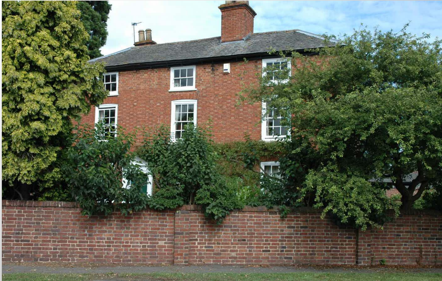
Fine Georgian Houses