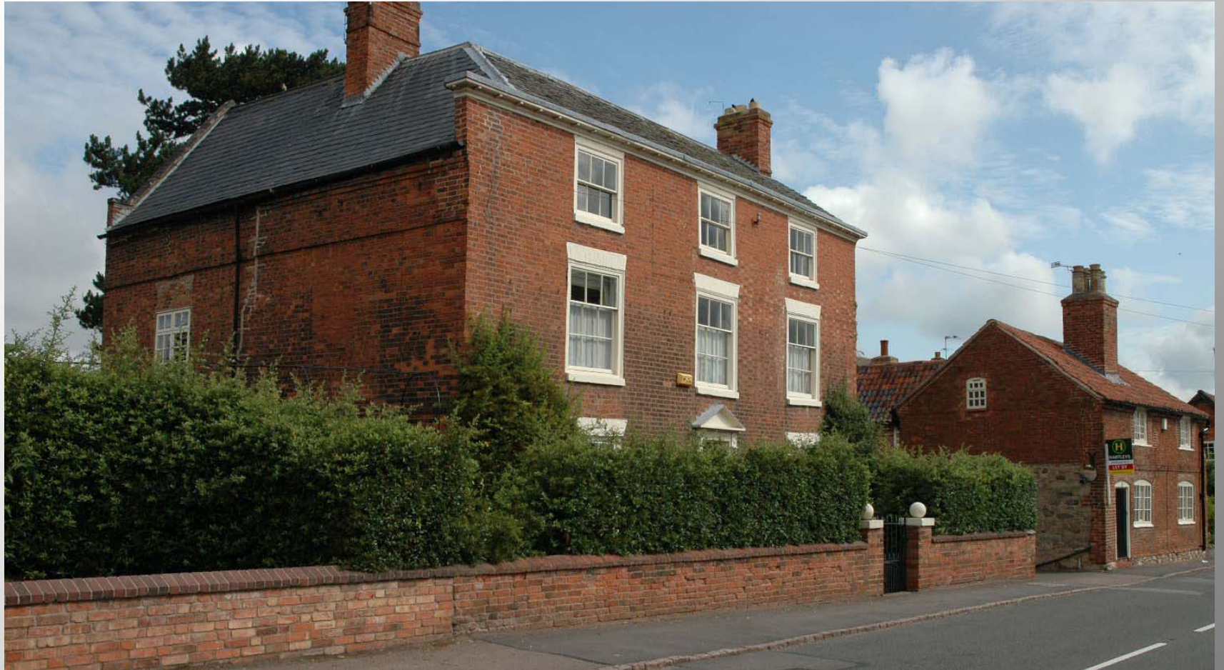
Fine Georgian Houses