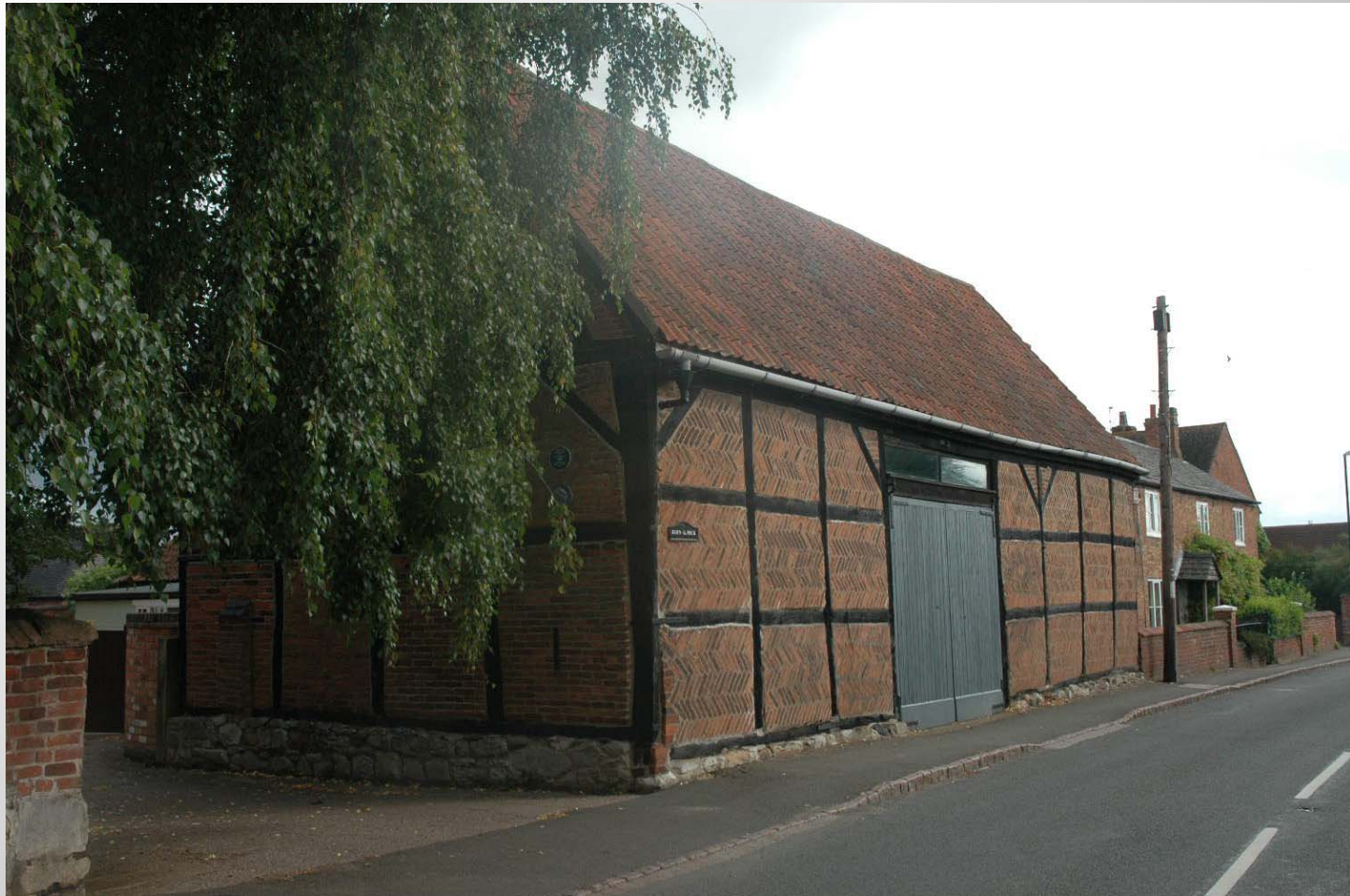
Especially the barn