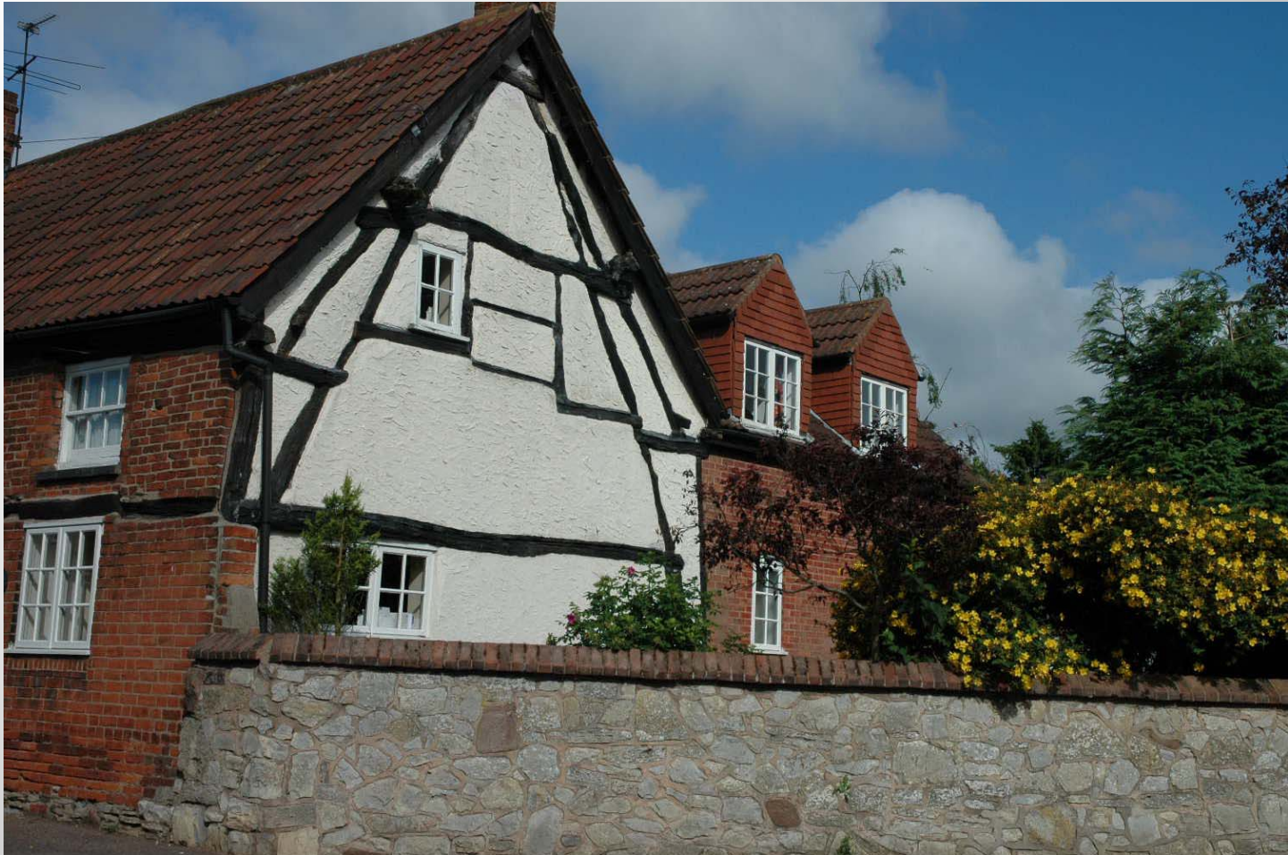
Some timber framed houses still visible