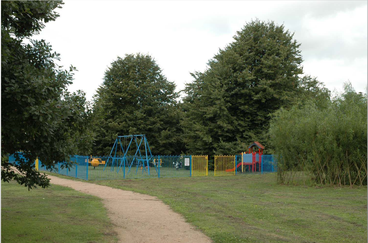
Trees and Green Spaces