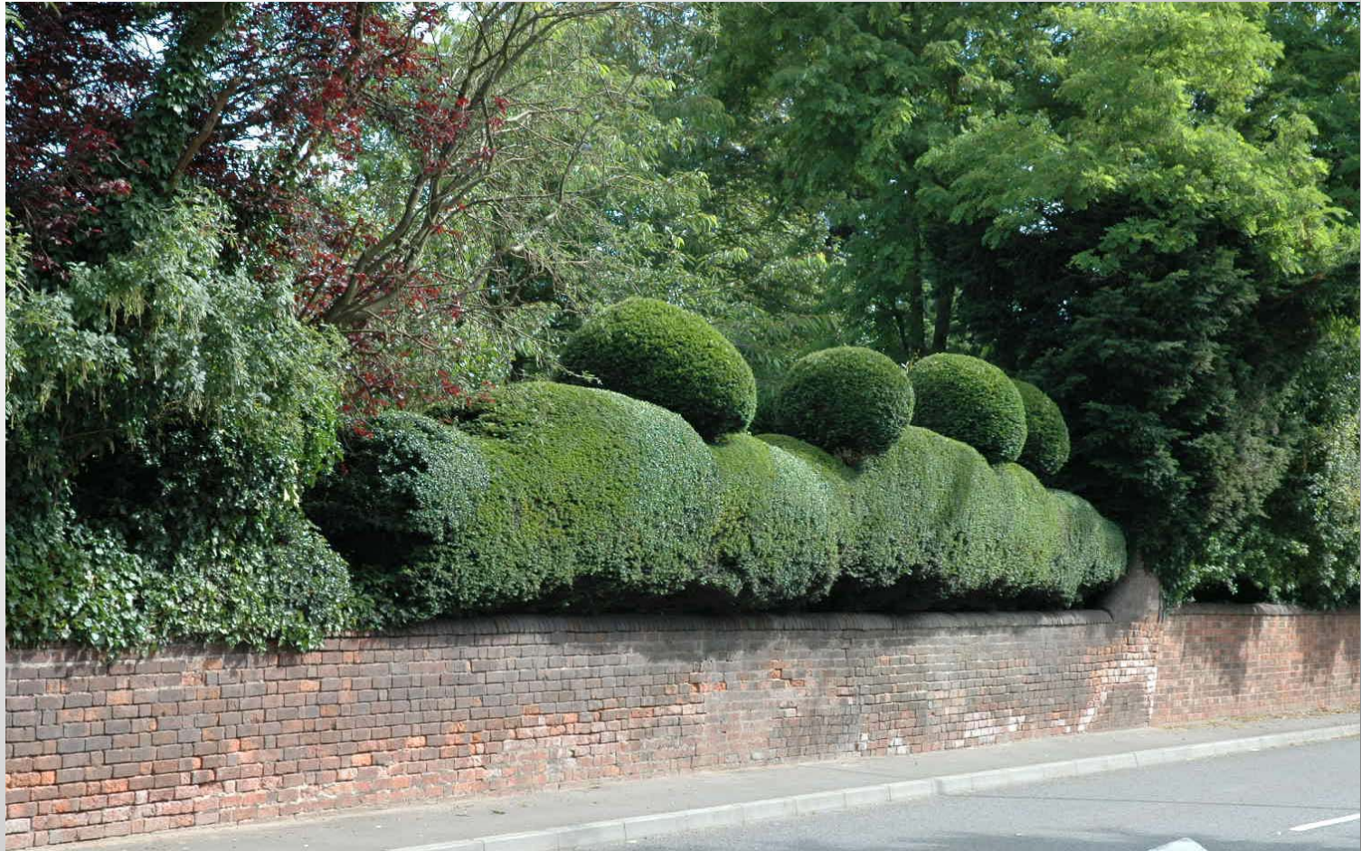
Trees and Green Spaces