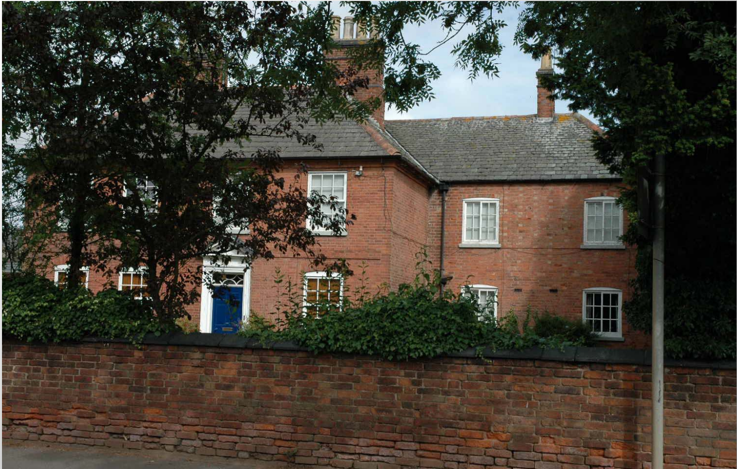
Fine Georgian Houses