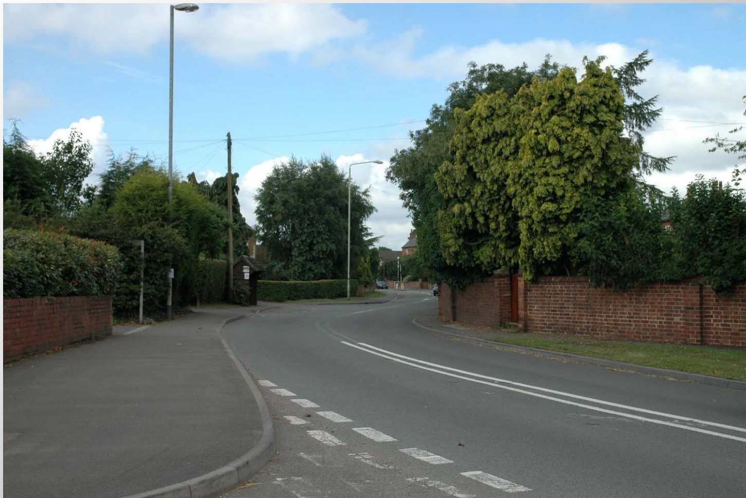
Winding Loughborough Road