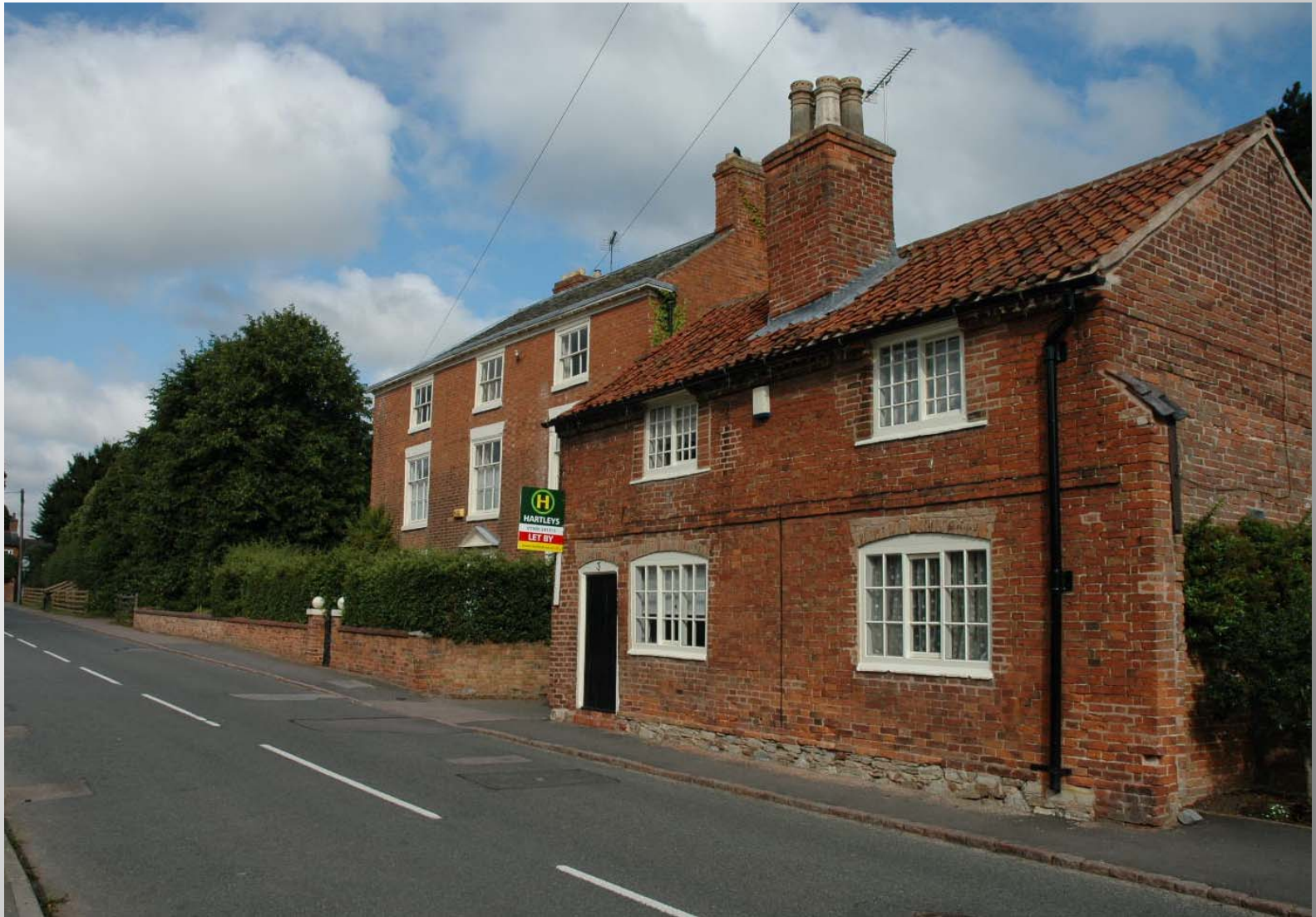
Larger houses set back : cottages at the edge of the pavement