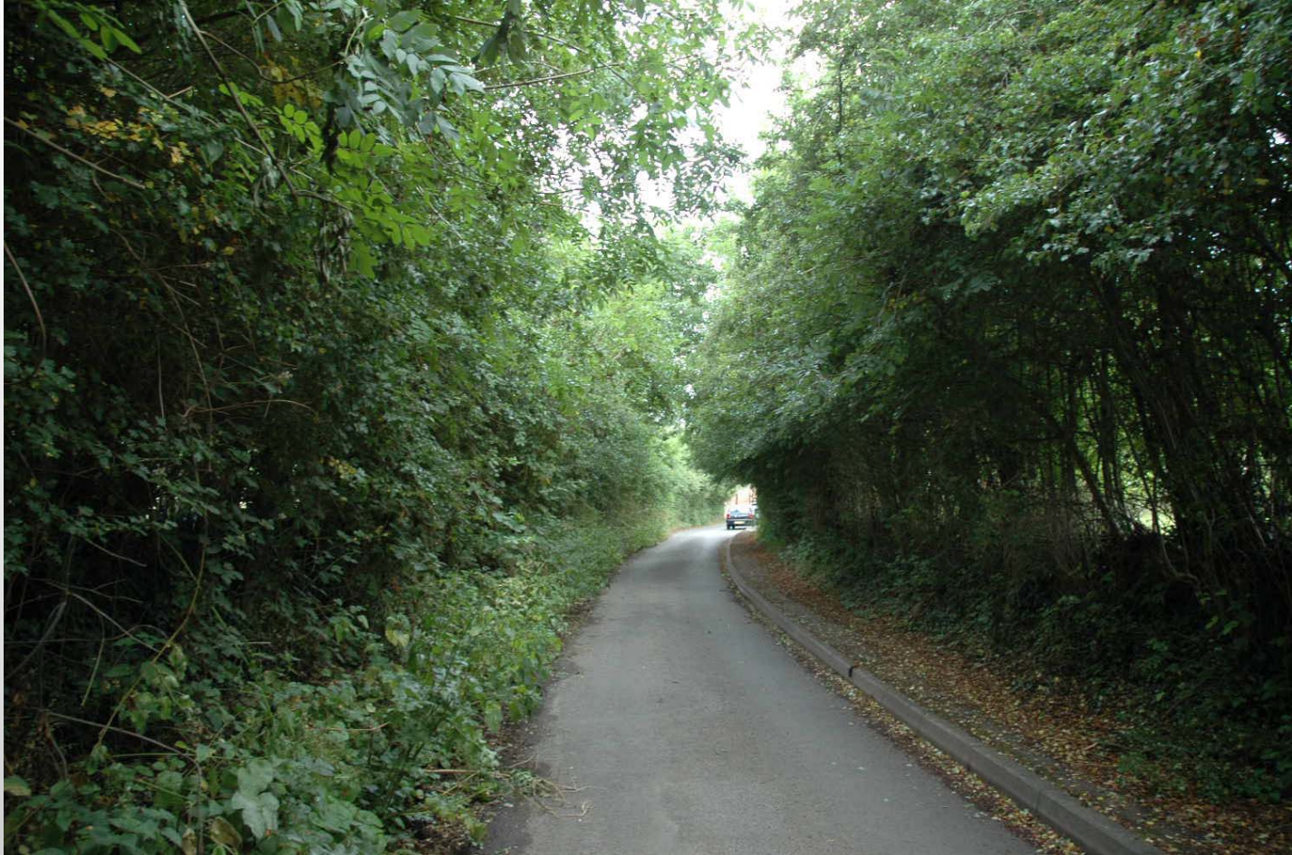
Trees and Green Spaces