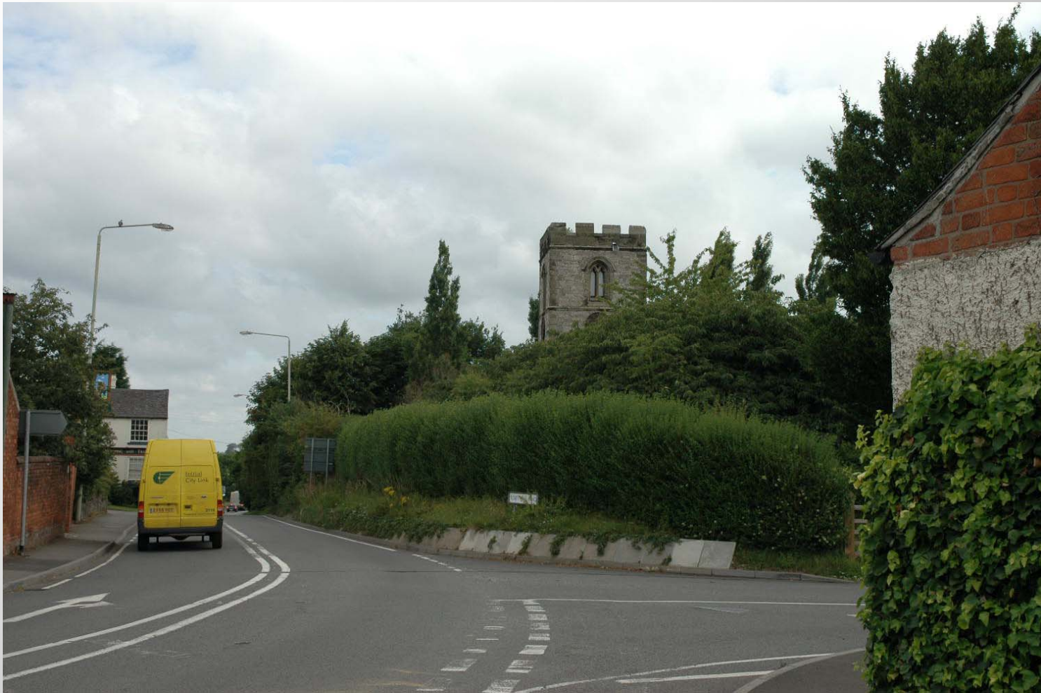
The centre of the village