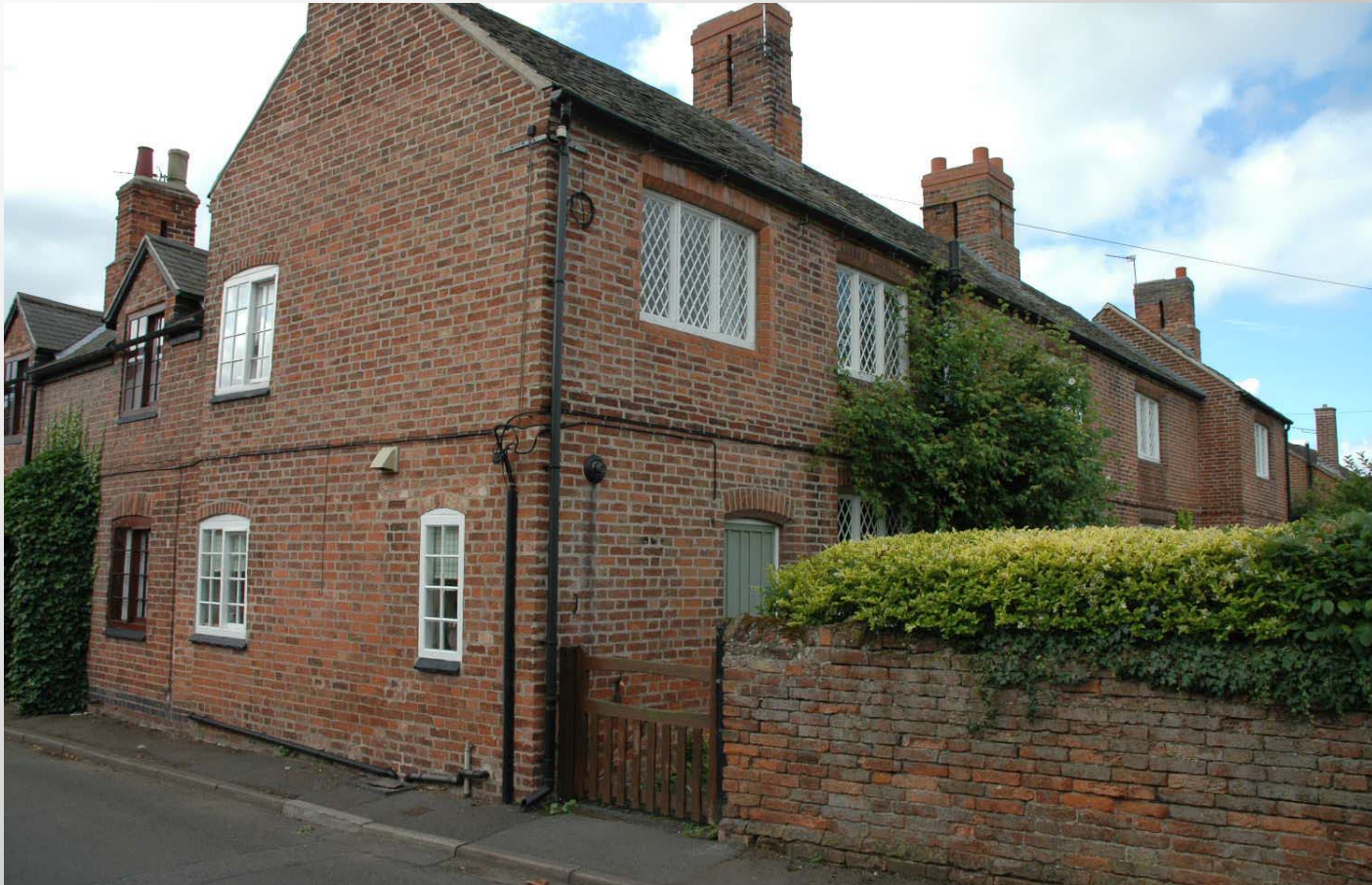
The Packe Almshouses