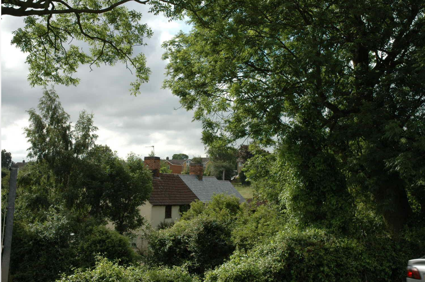
Trees and Green Spaces