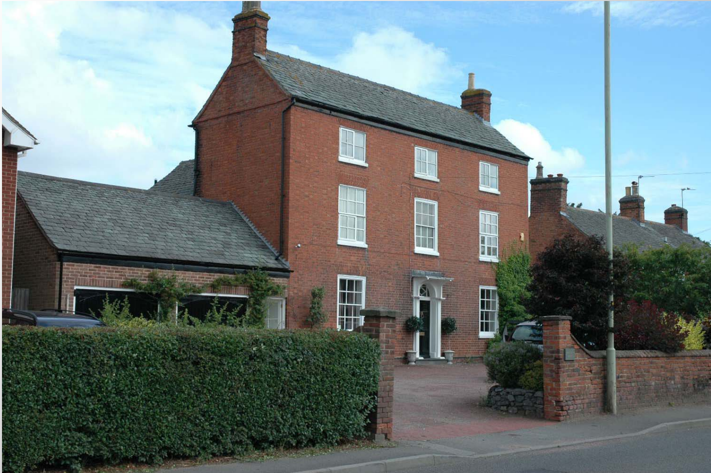
Fine Georgian Houses