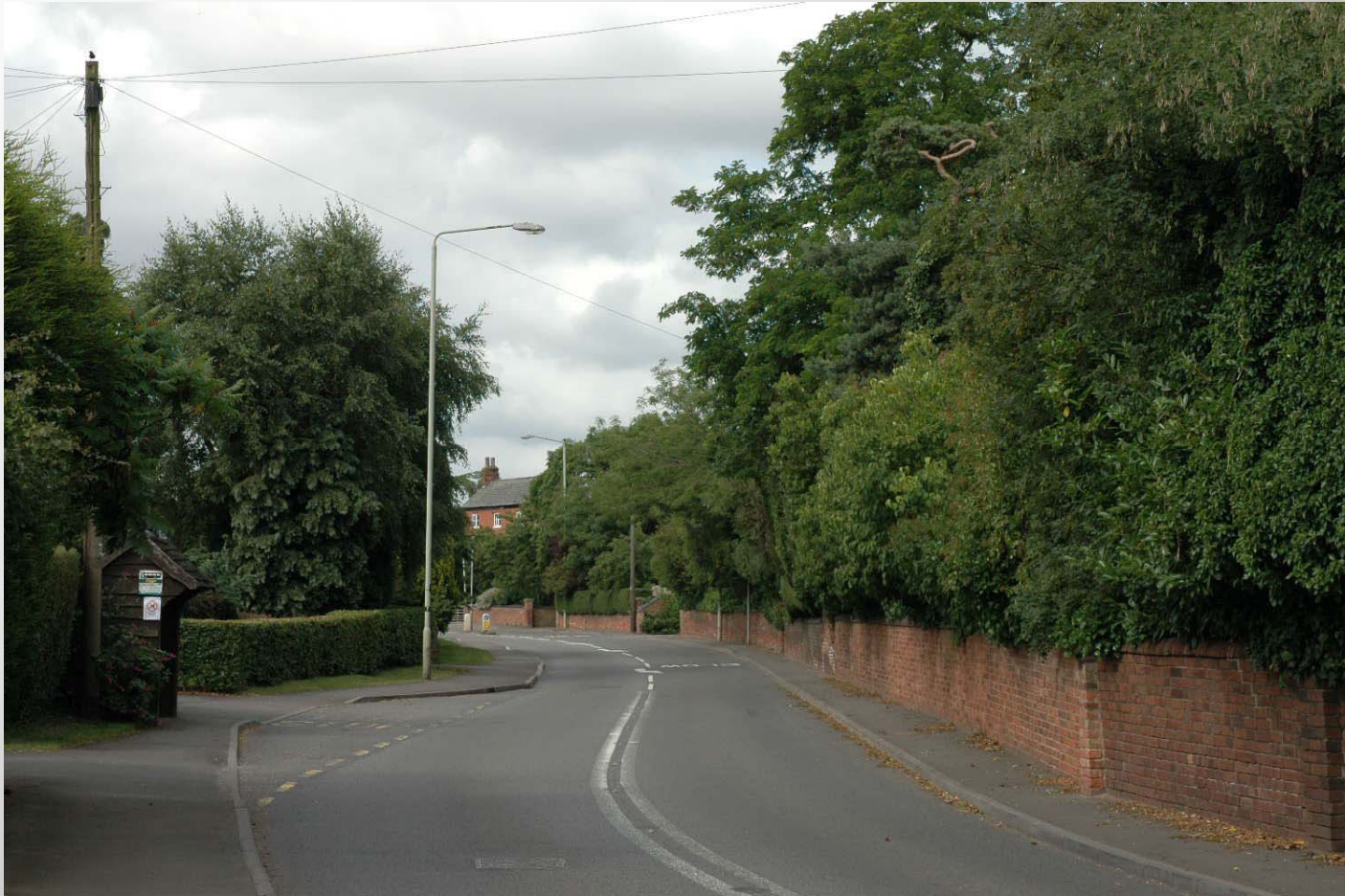
Trees and Green Spaces