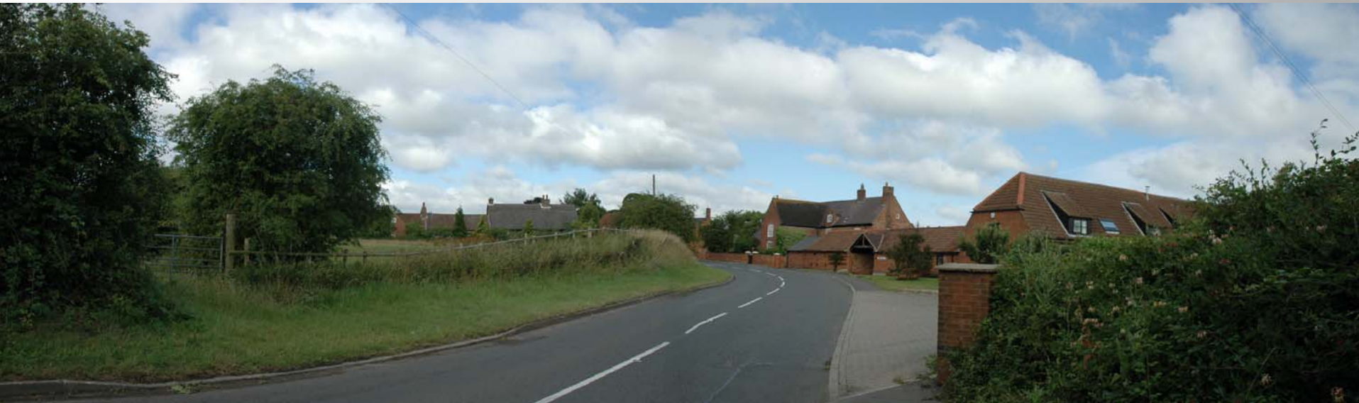
The entry into the village from Wymeswold