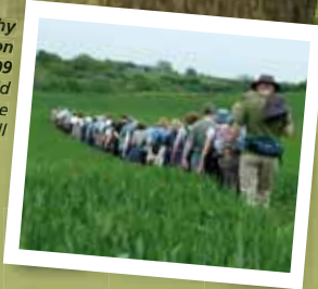
Photography Competition Winner 2009 Wheatfield Crocodile by L. Hextall