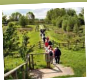
Photography Competition Winner 2008