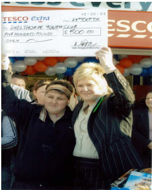
ACCEPTING THE CHEQUE

We have also recently learnt that we have been successful in obtaining a £500 donation from Tesco, a cheque was presented to the Young People on the 23 rd October 2006. They were happy to cut the ribbon to re-launch the new Tesco. Tesco also gave them surprise gifts of a Microwave, Kettle, Toaster and Smoothie Maker. The young people were thrilled to accept these and are as yet, unsure what they will purchase. To be fair they have a very long 'wish' list and are spoilt for choice.