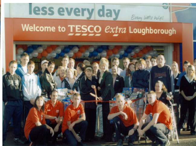
CUTTING THE RIBBON