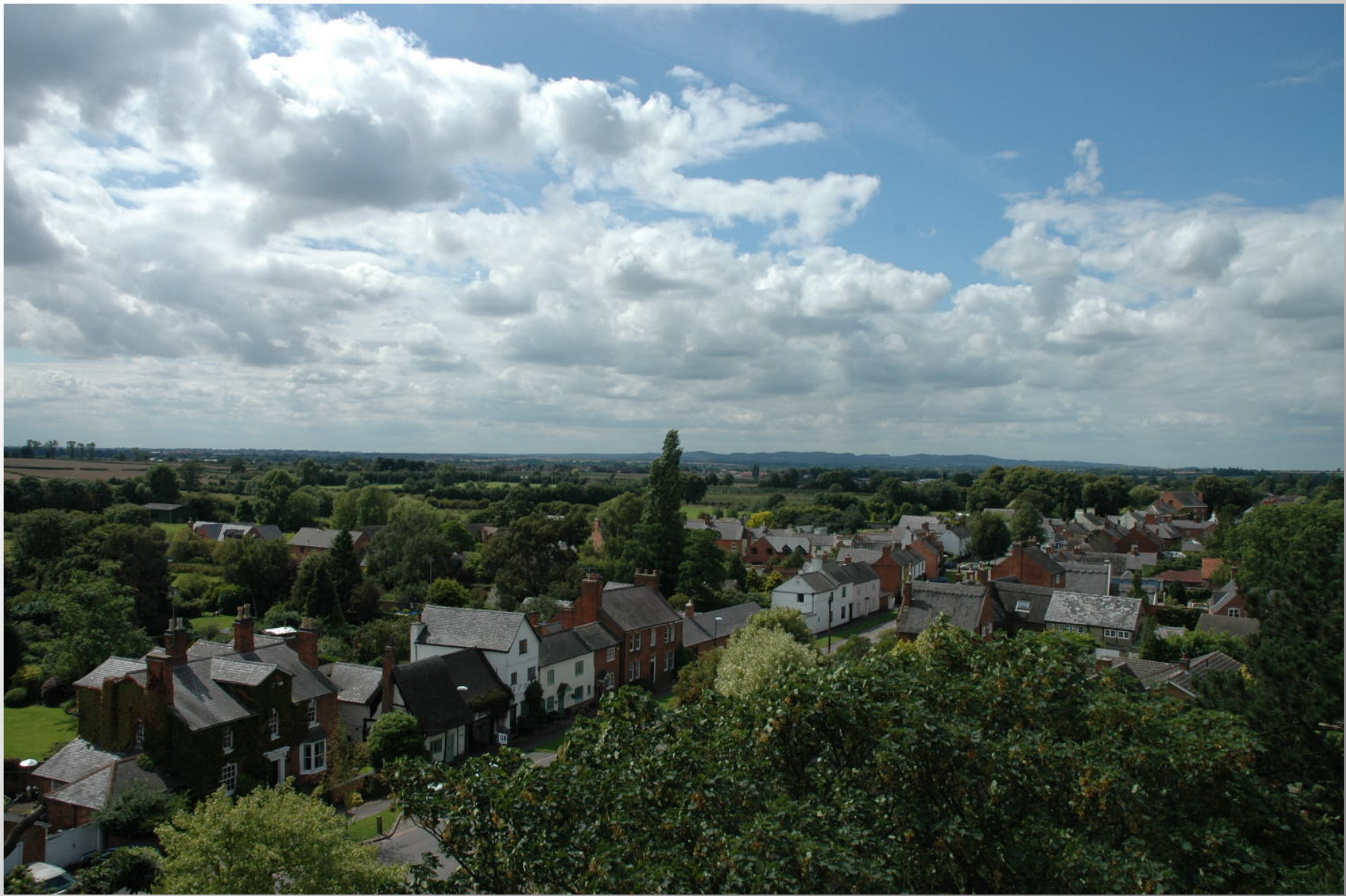
The panorama from the top of the tower