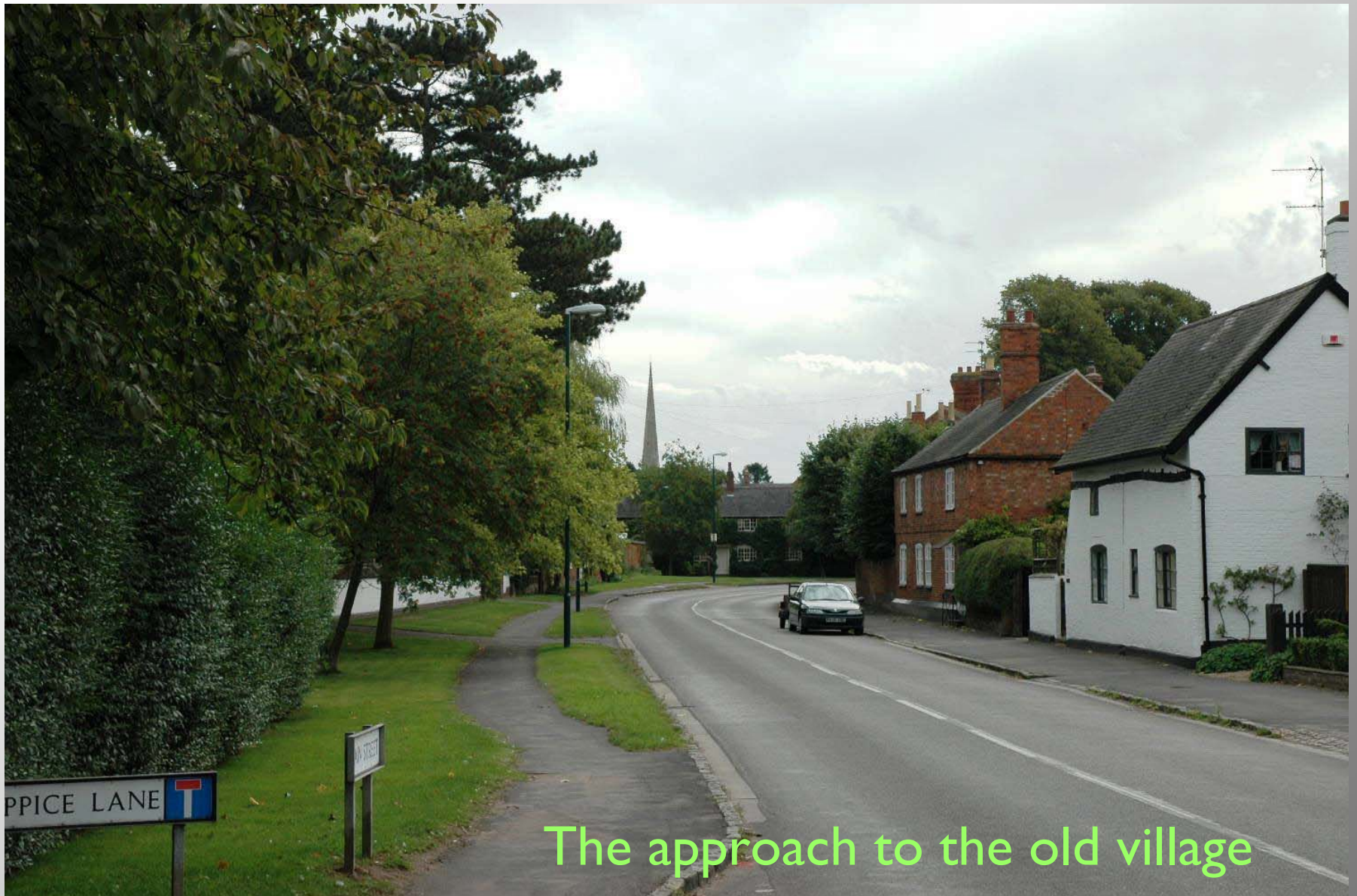
The approach to the old village