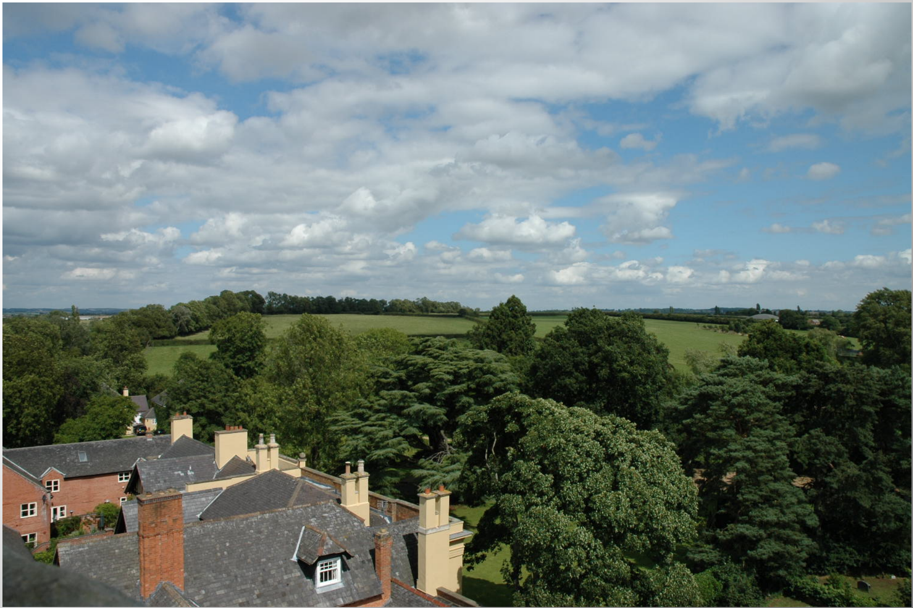
The panorama from the top of the tower