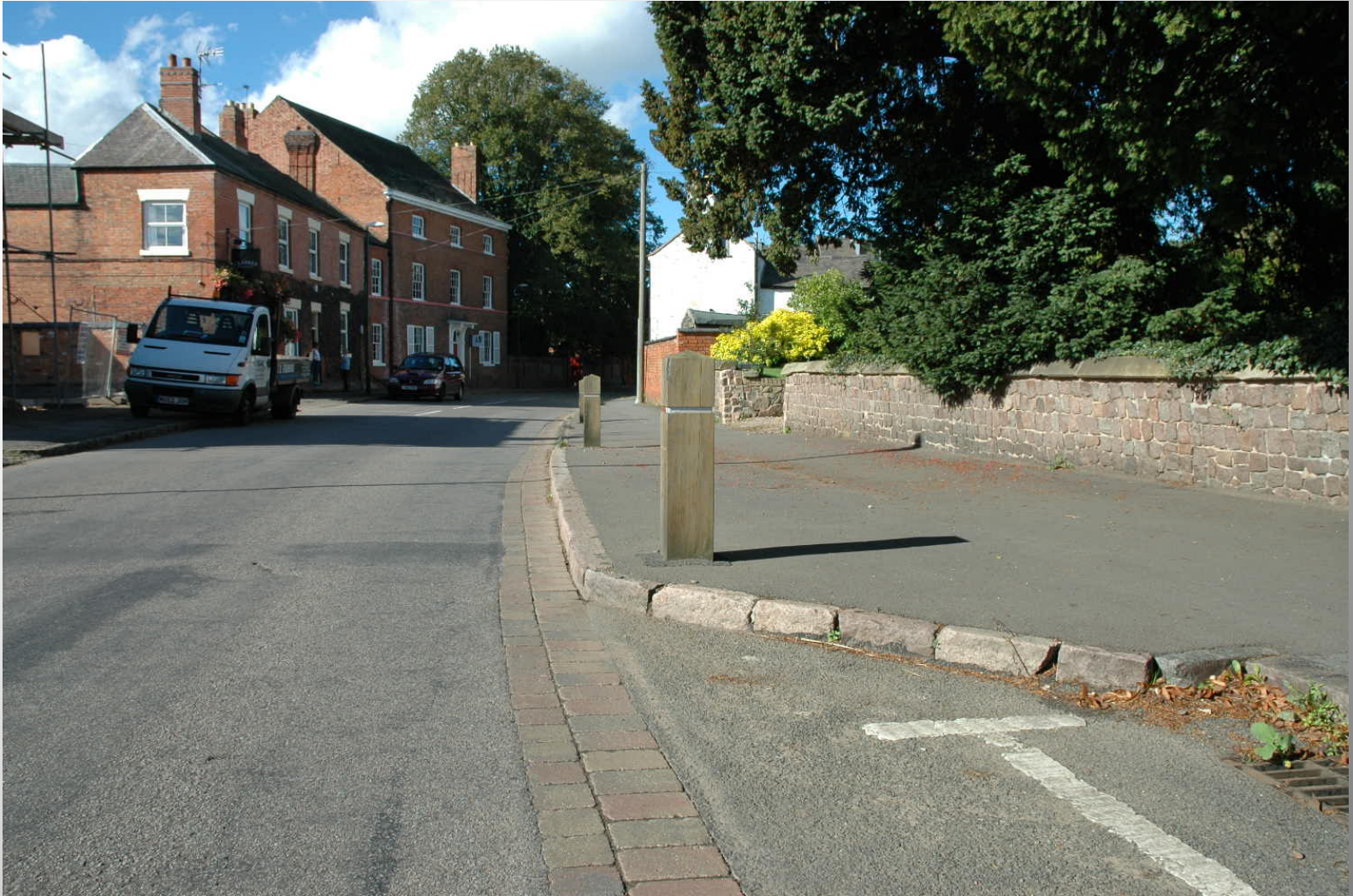
Calm and dignified treatment of the highway