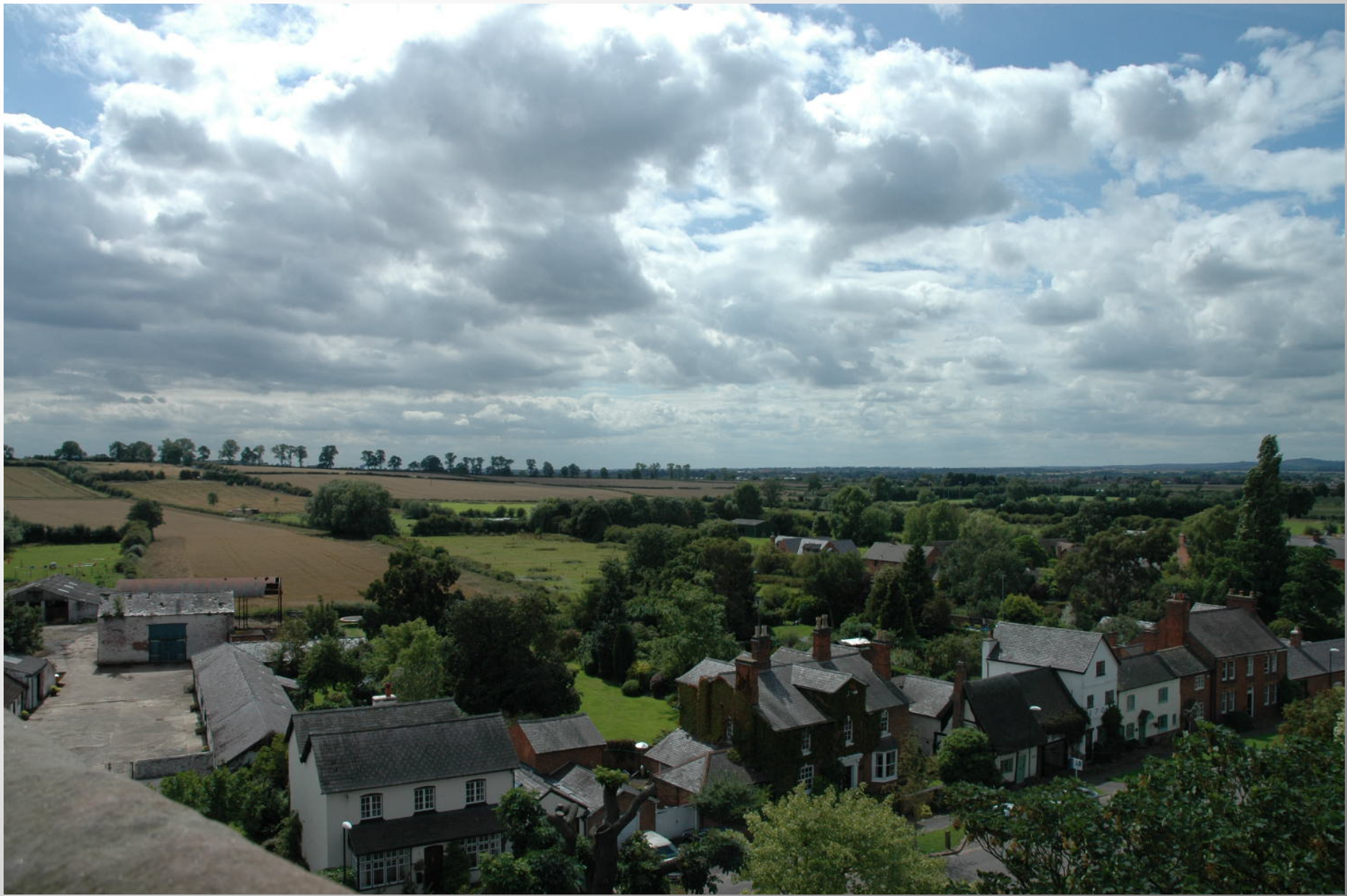
The panorama from the top of the tower