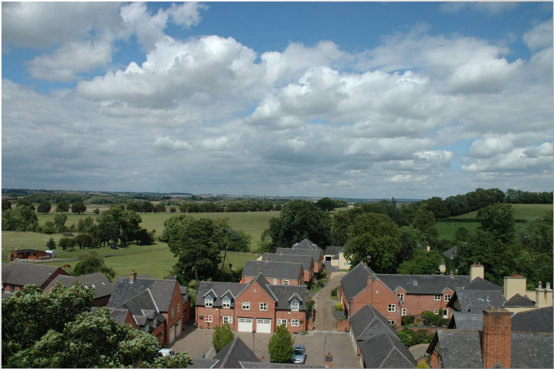
The panorama from the top of the tower