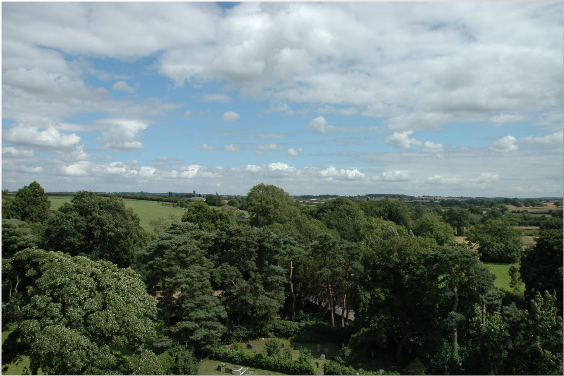
The panorama from the top of the tower