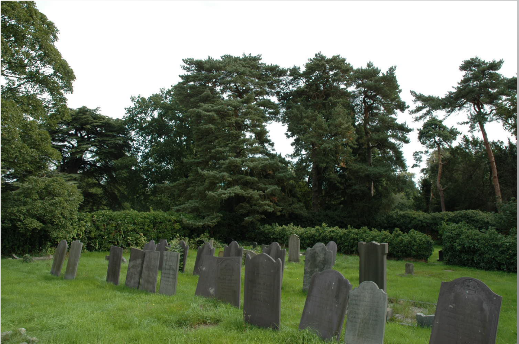
The peaceful space of the churchyard