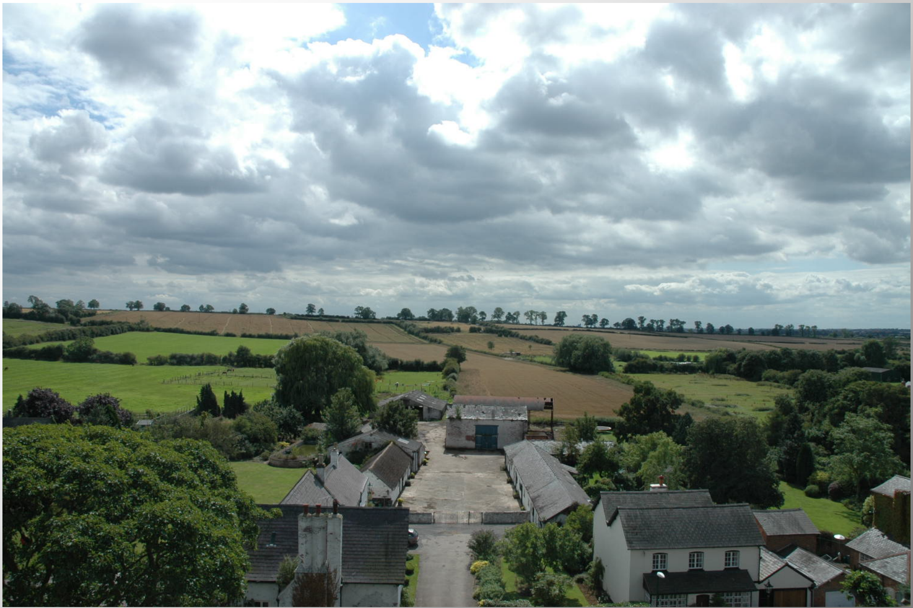
The panorama from the top of the tower