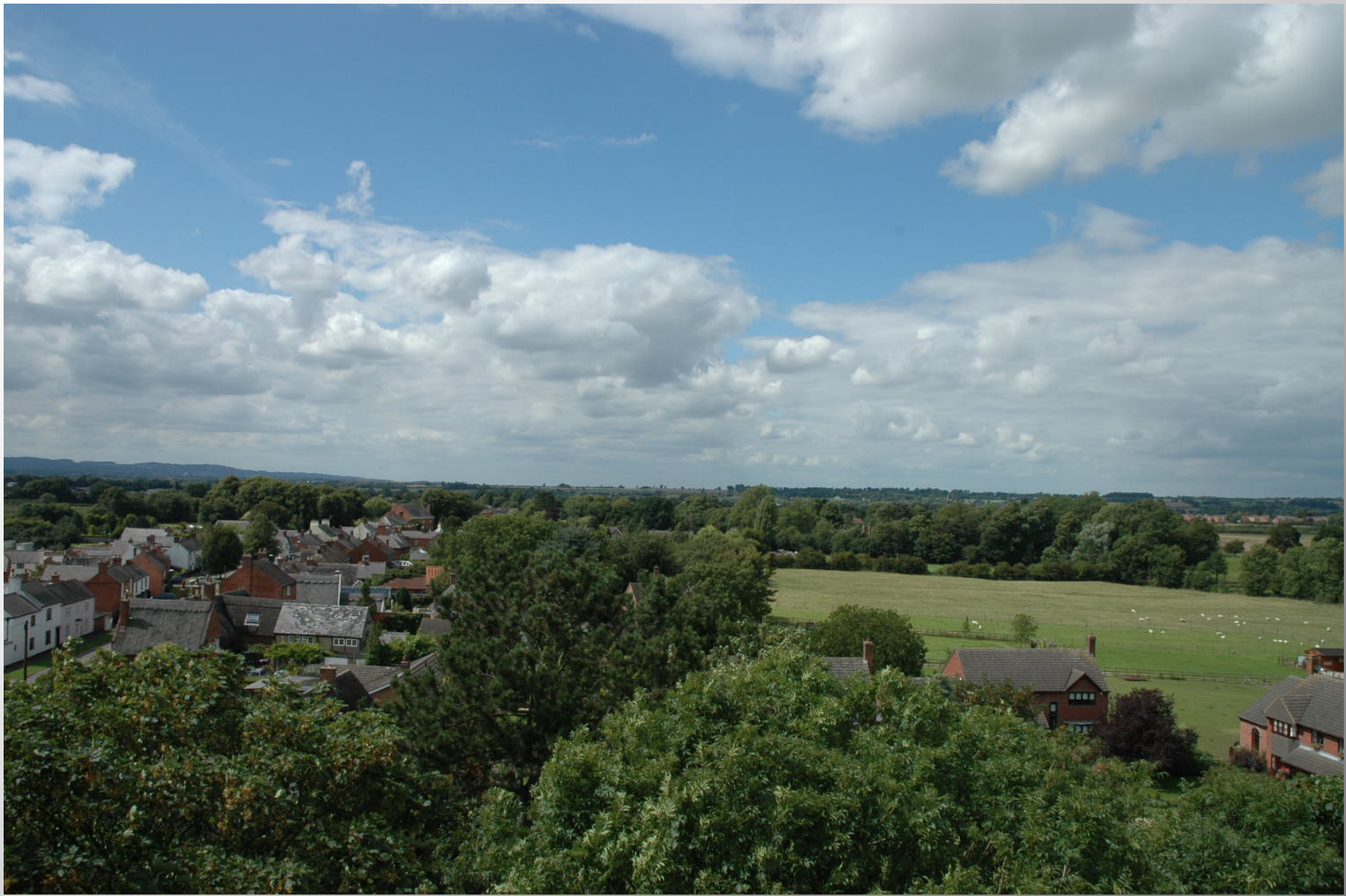
The panorama from the top of the tower