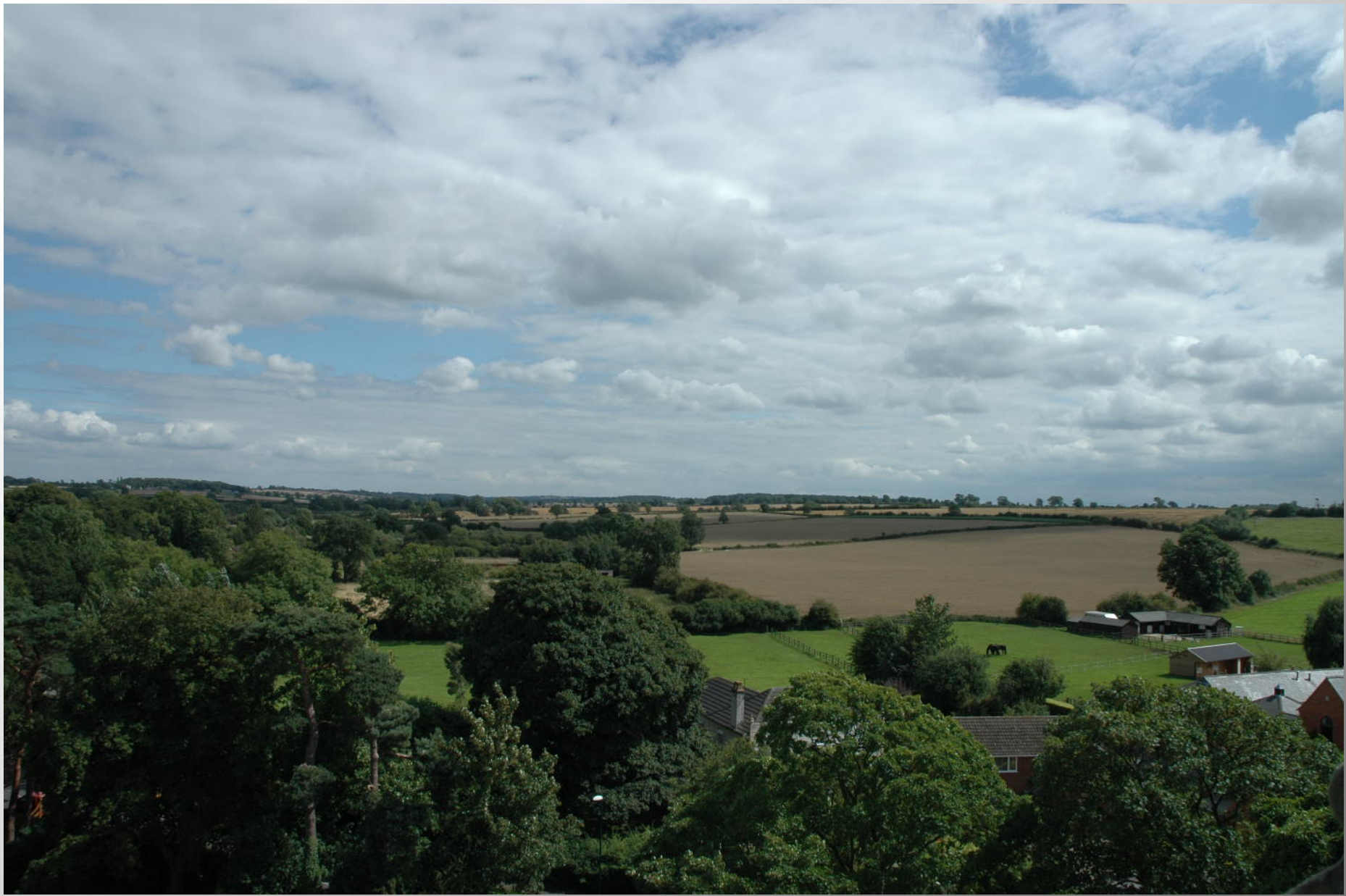
The panorama from the top of the tower