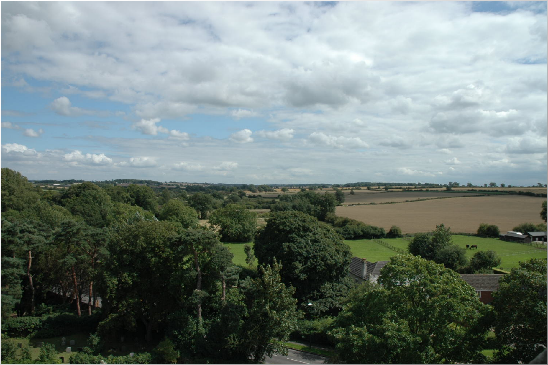
The panorama from the top of the tower