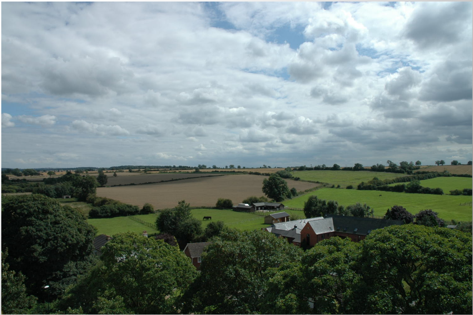
The panorama from the top of the tower