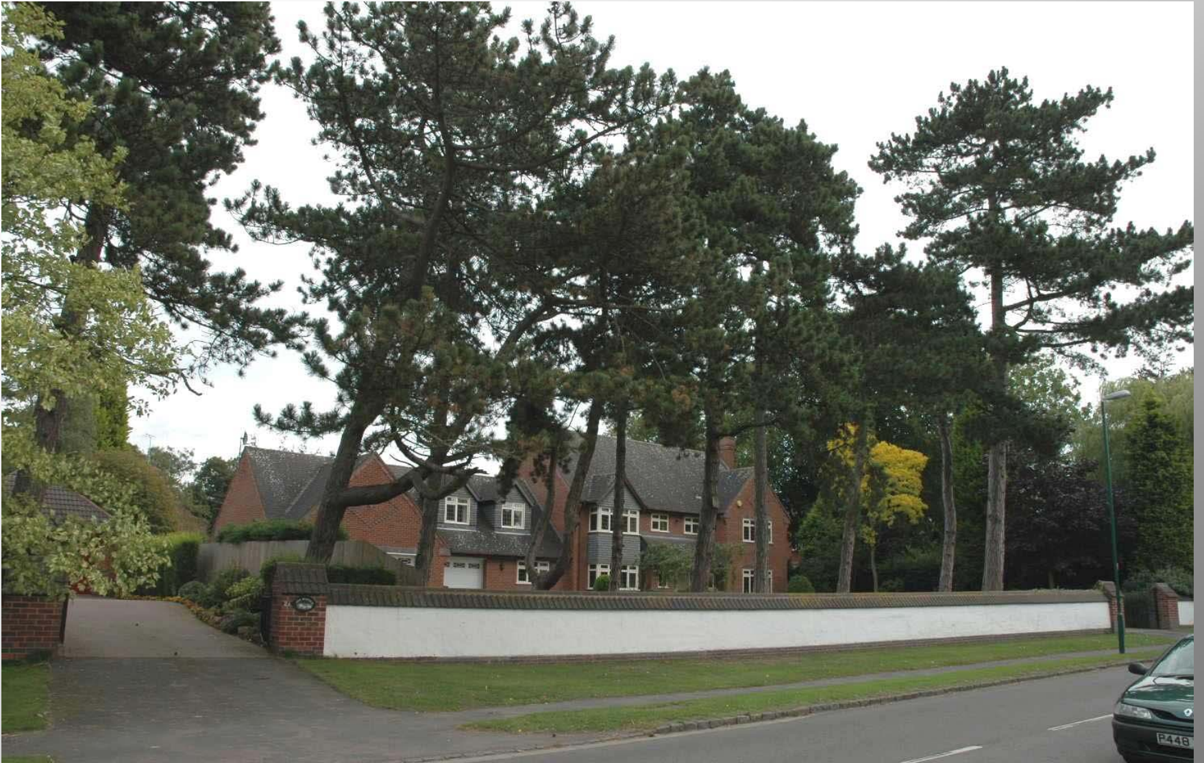
Pine trees and the mud wall of the old Pinfold