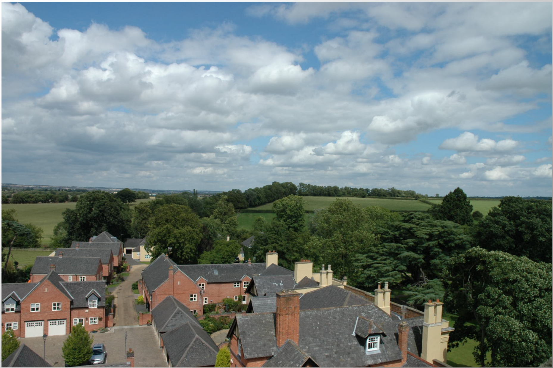
The panorama from the top of the tower