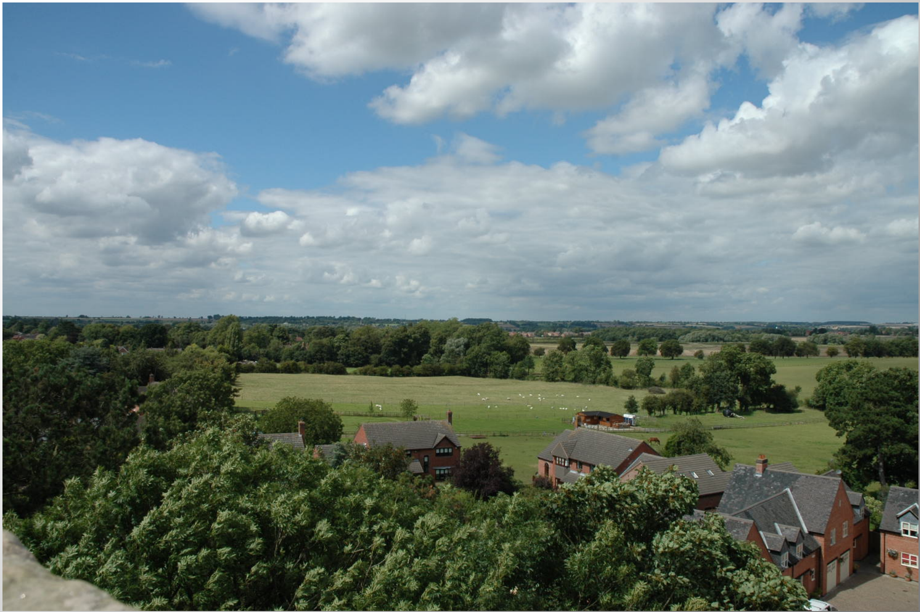
The panorama from the top of the tower