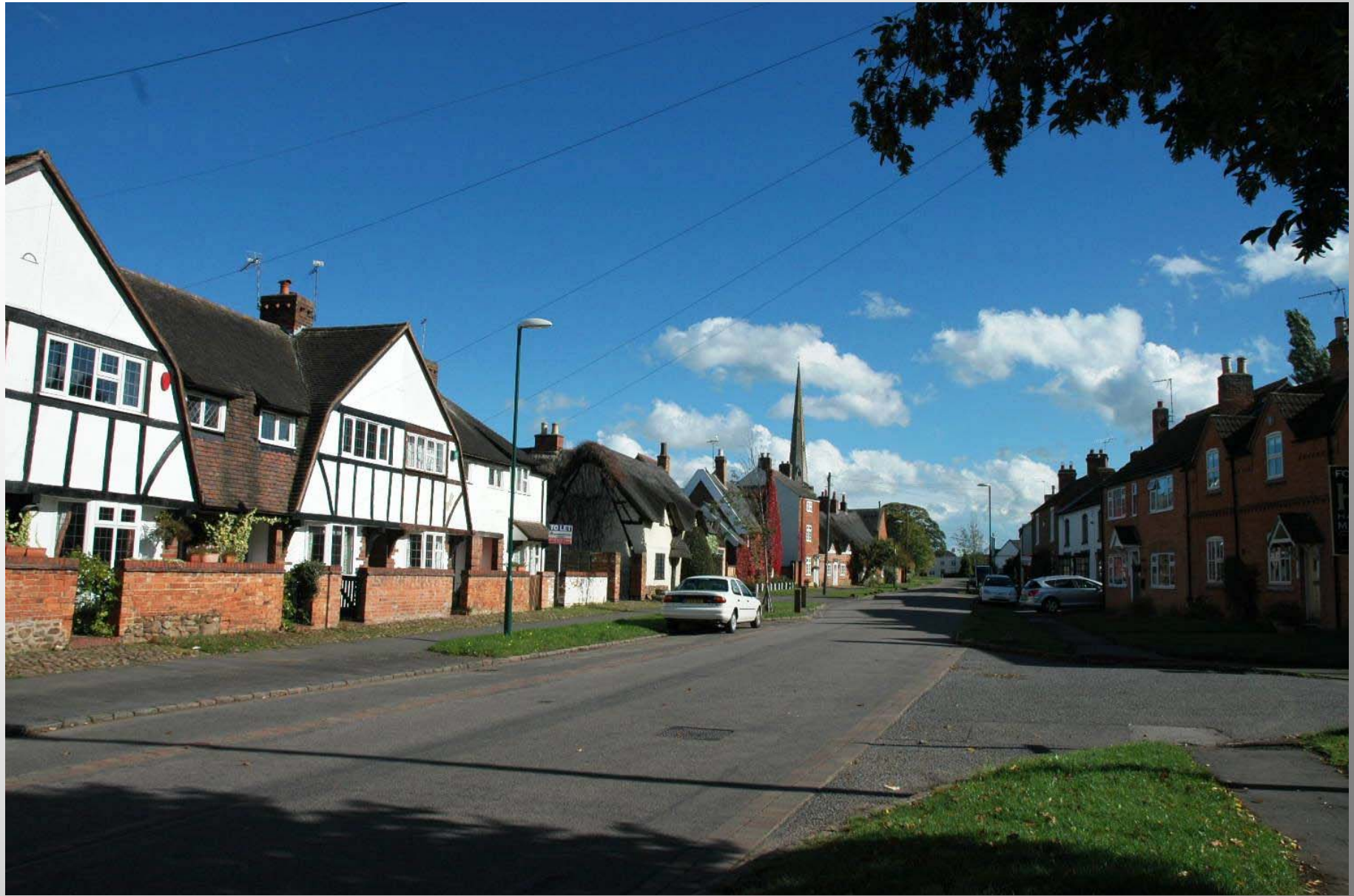
The broad feel of Main Street