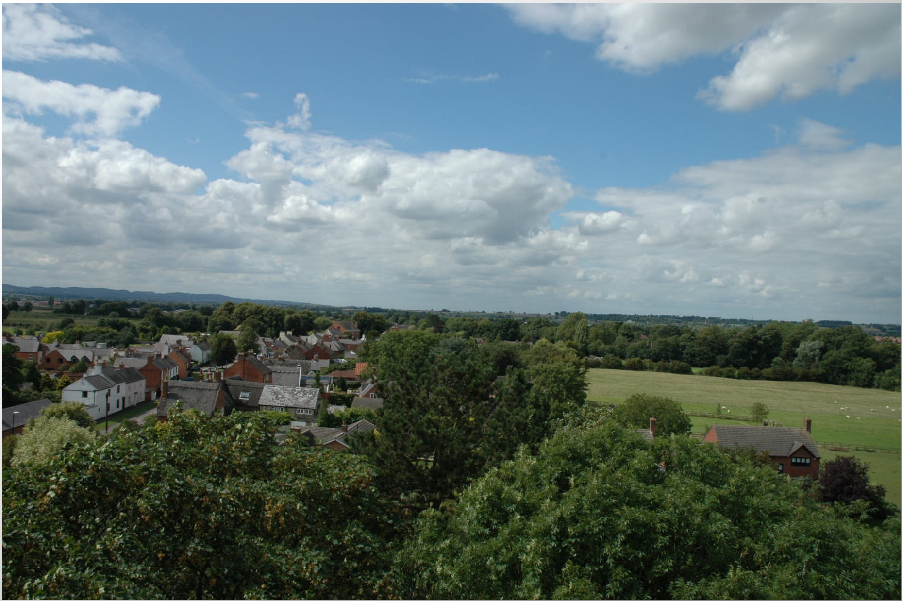
The panorama from the top of the tower