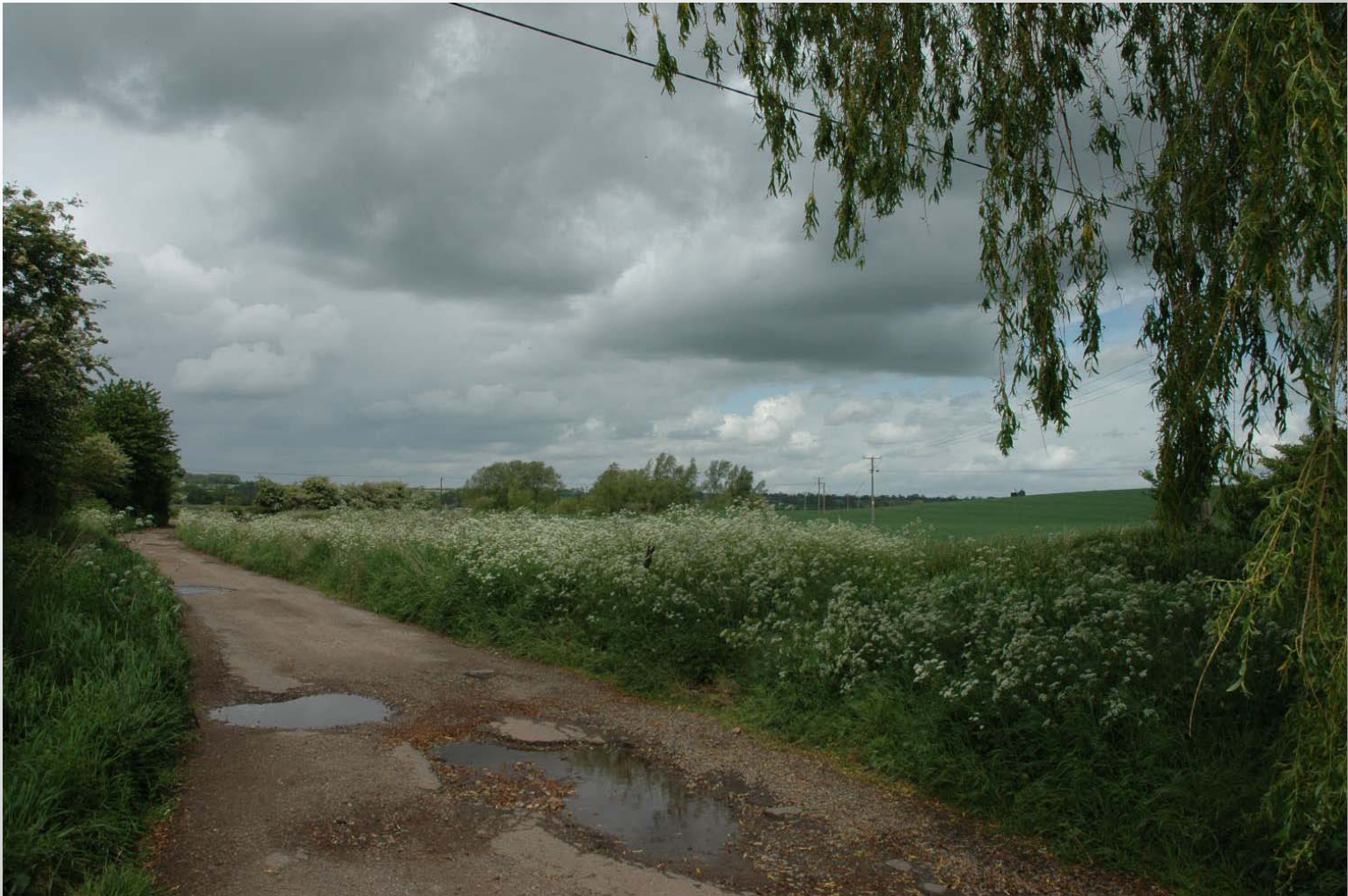
Looking out to the meadows