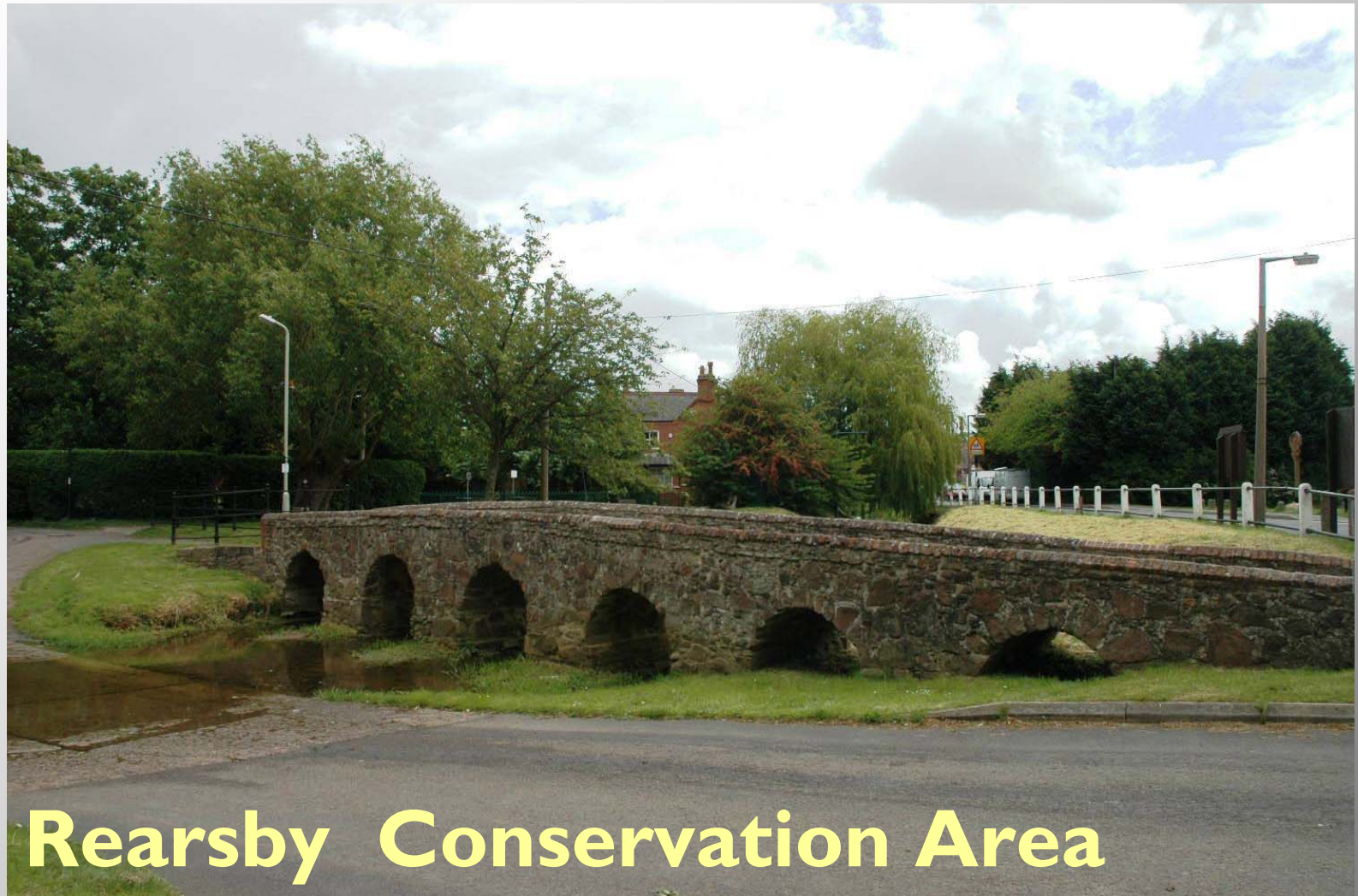
Rearsby Conservation Area