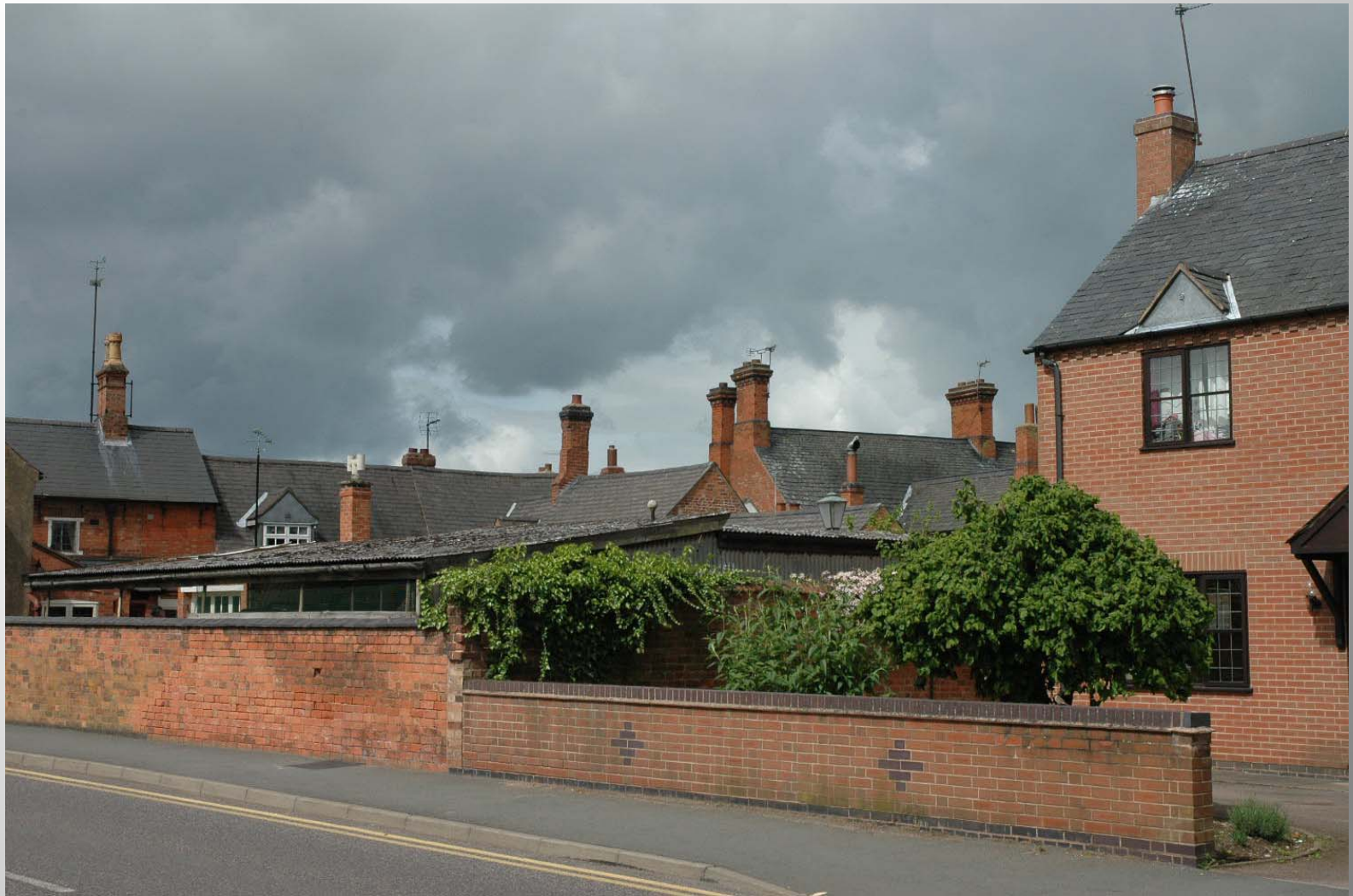
Roofscape with chimneys