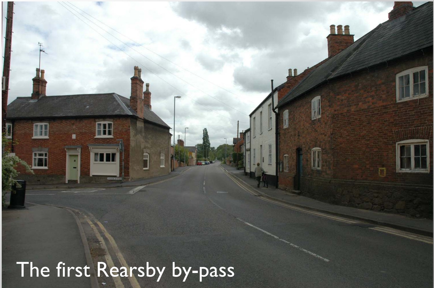
The first Rearsby by-pass