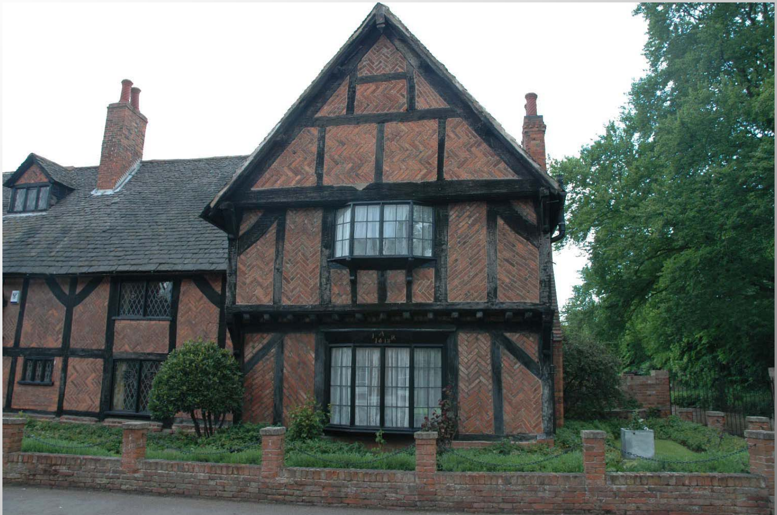
Variety of buildings reflecting the history