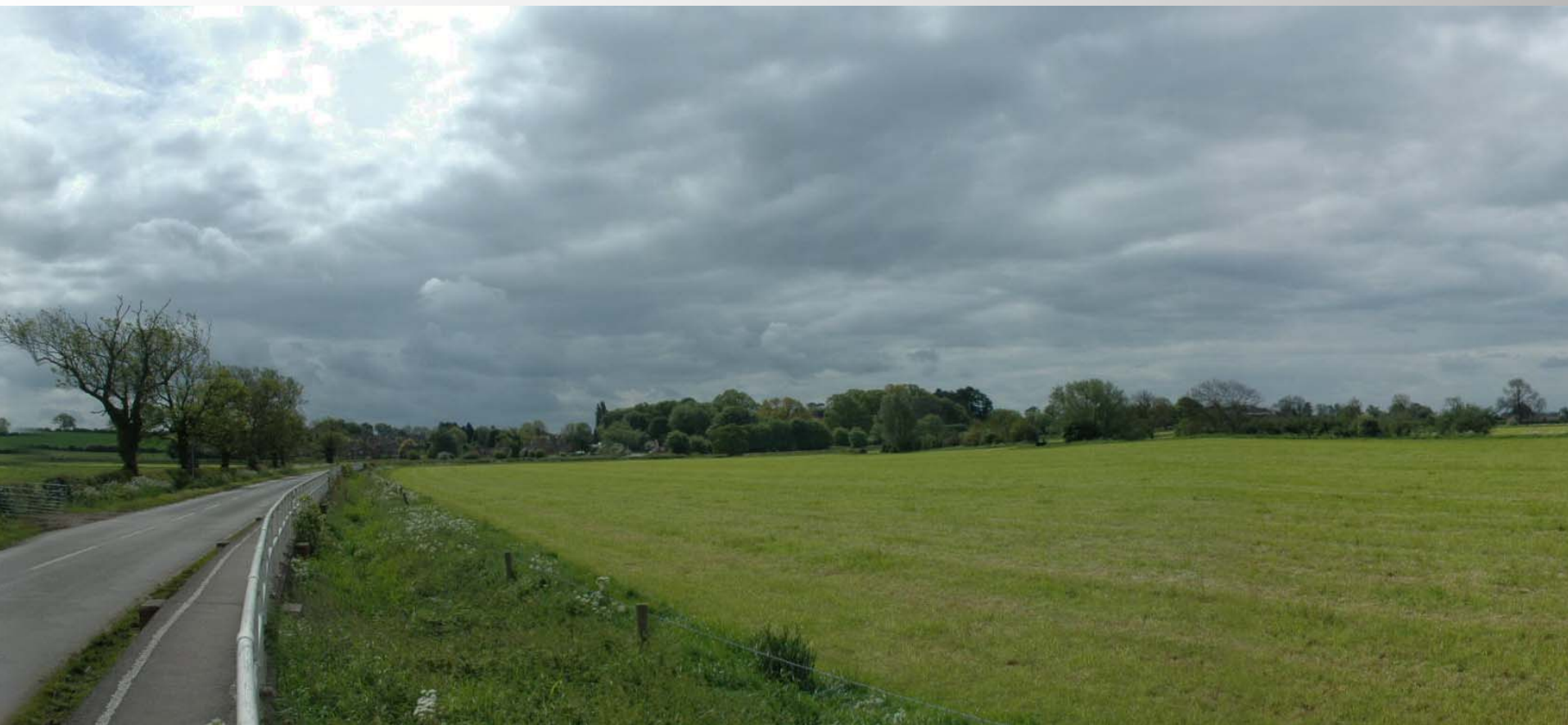
On the edge of the Wreake Valley