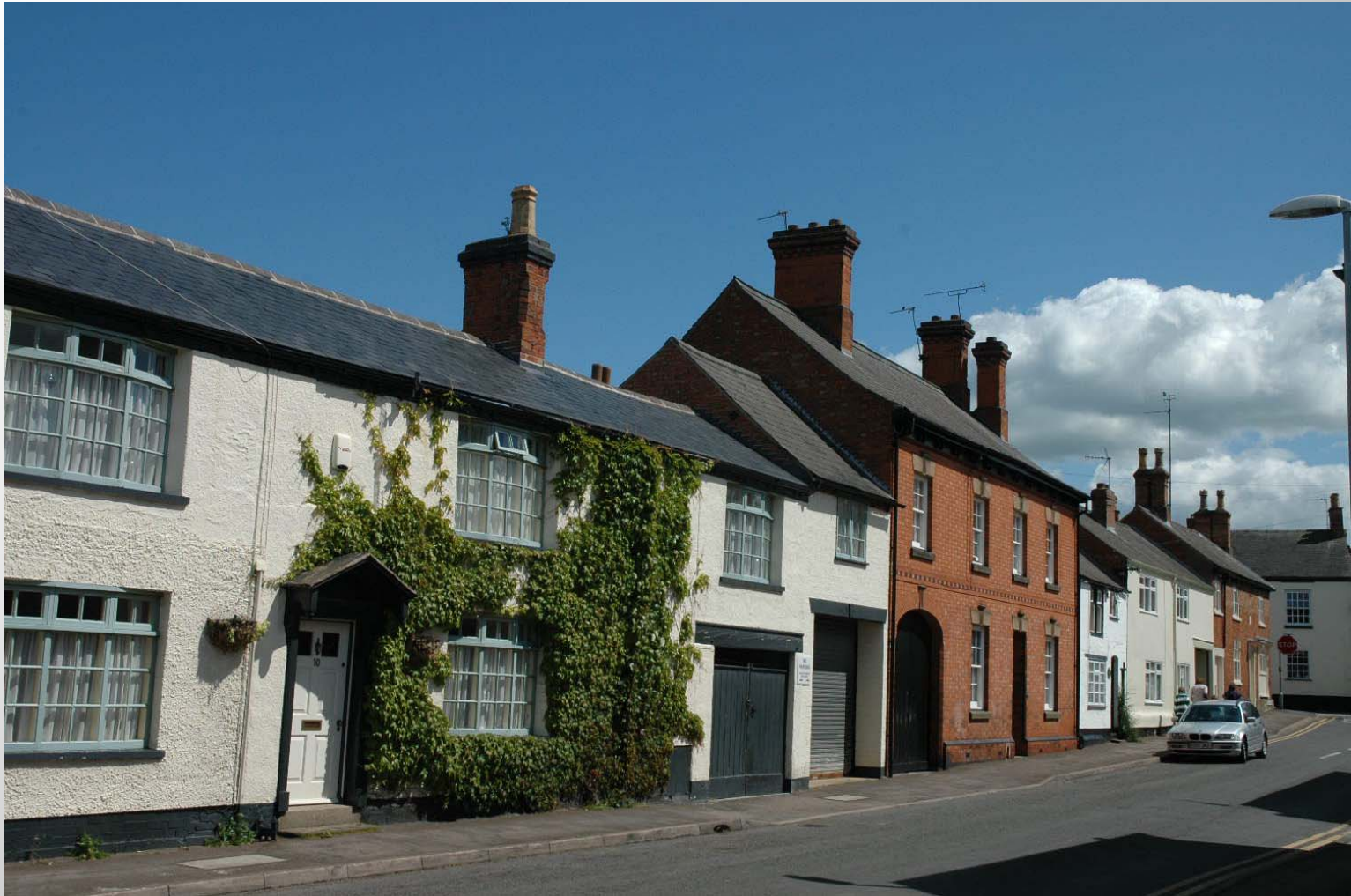
Streetscape with the rhythm of Rooves