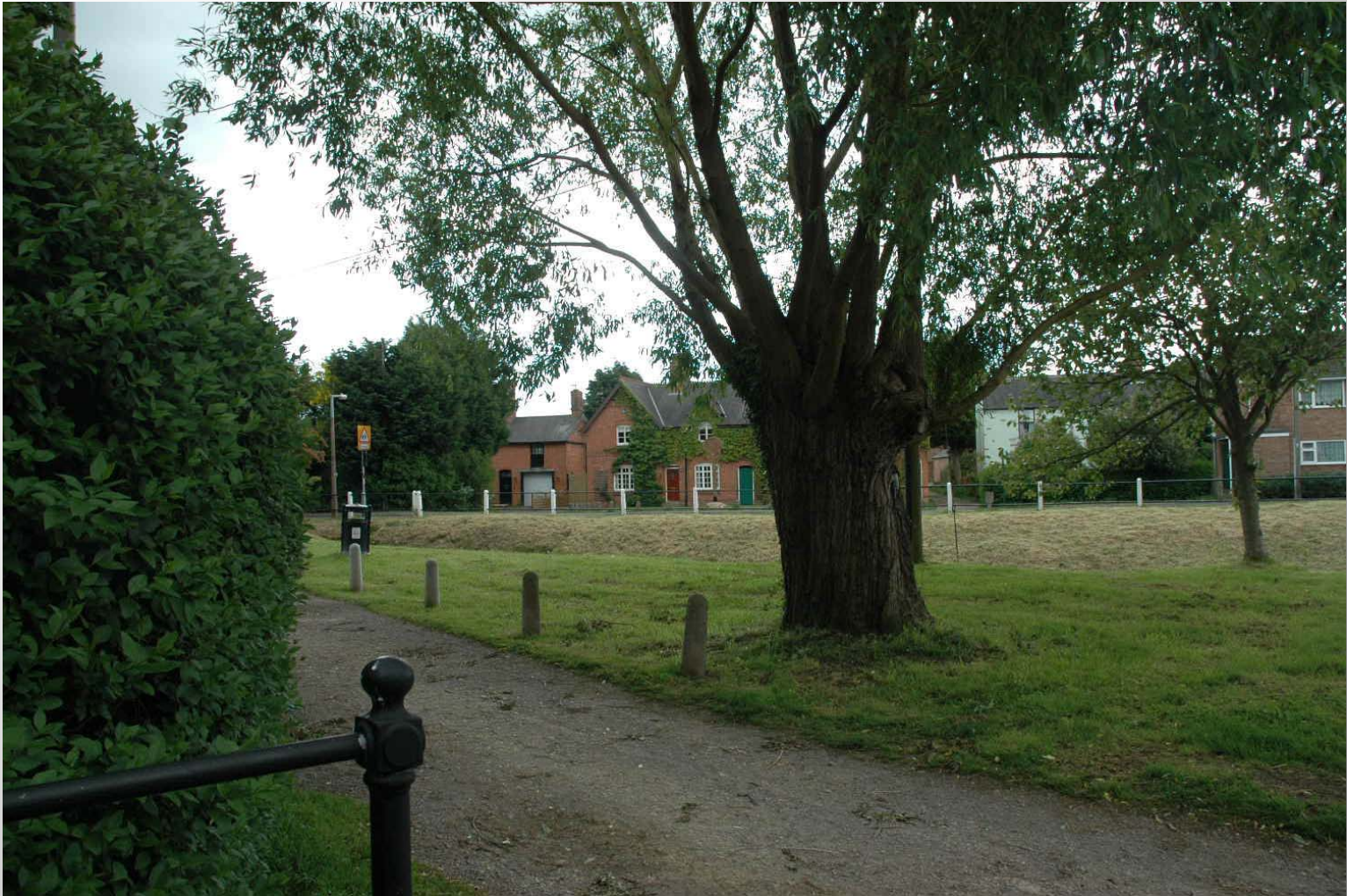
Trees and Green spaces