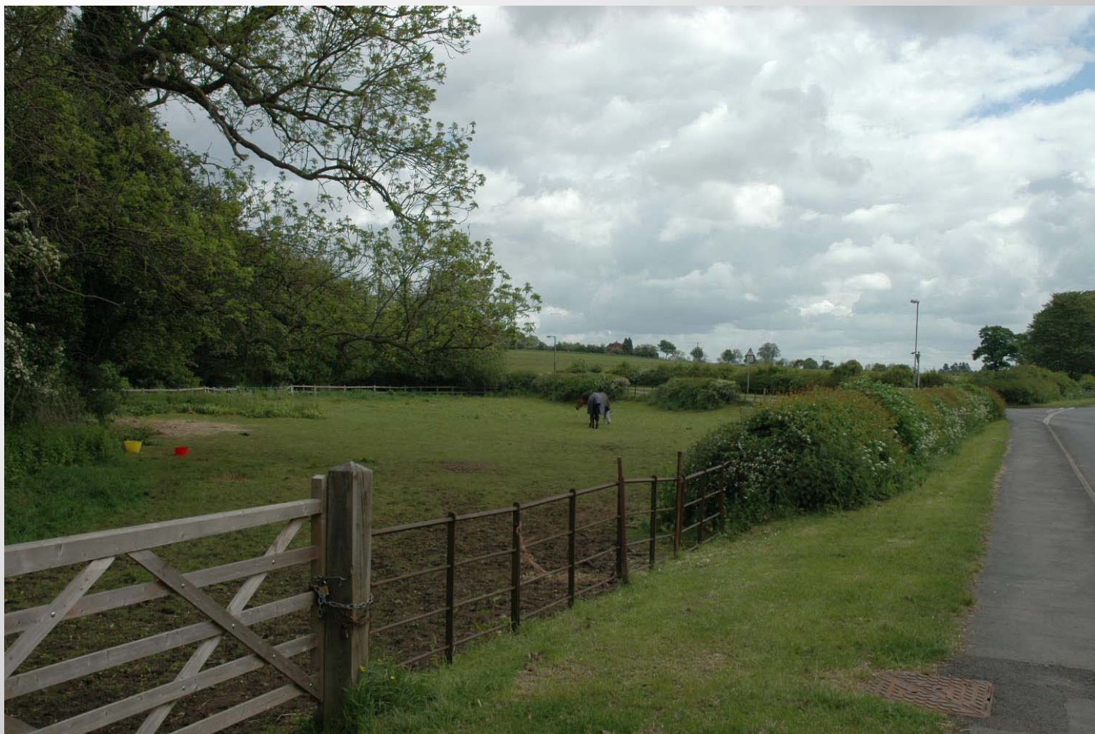
Trees and Green spaces