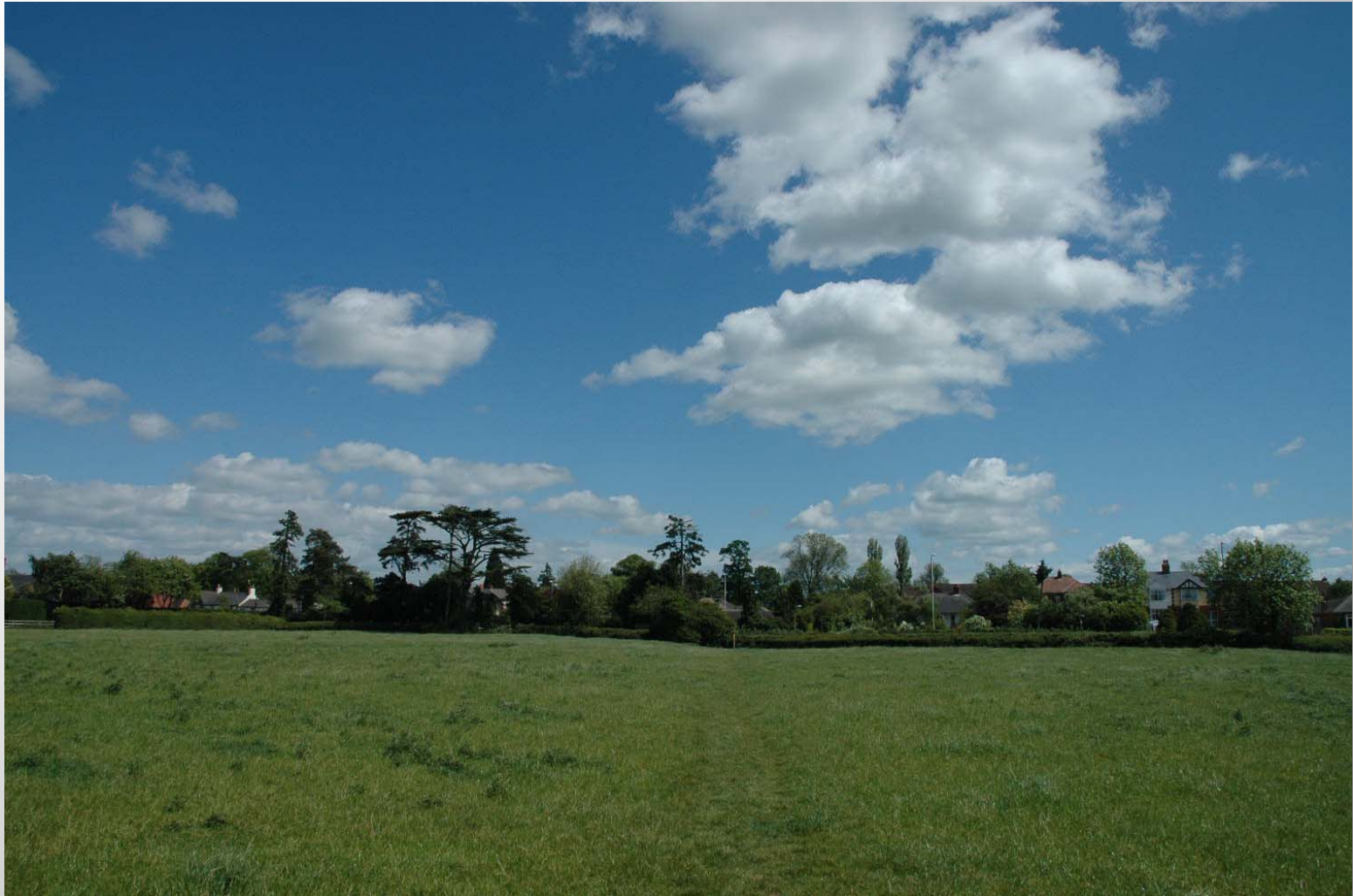
The village, largely hidden in the trees