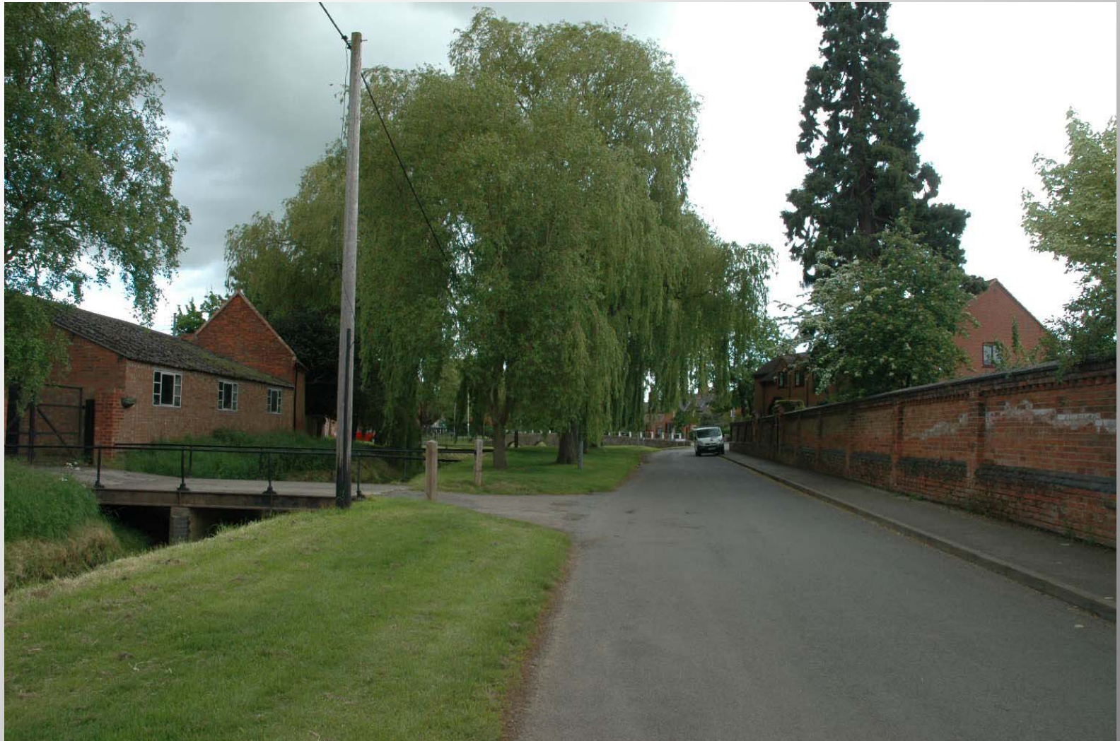
Trees and Green spaces