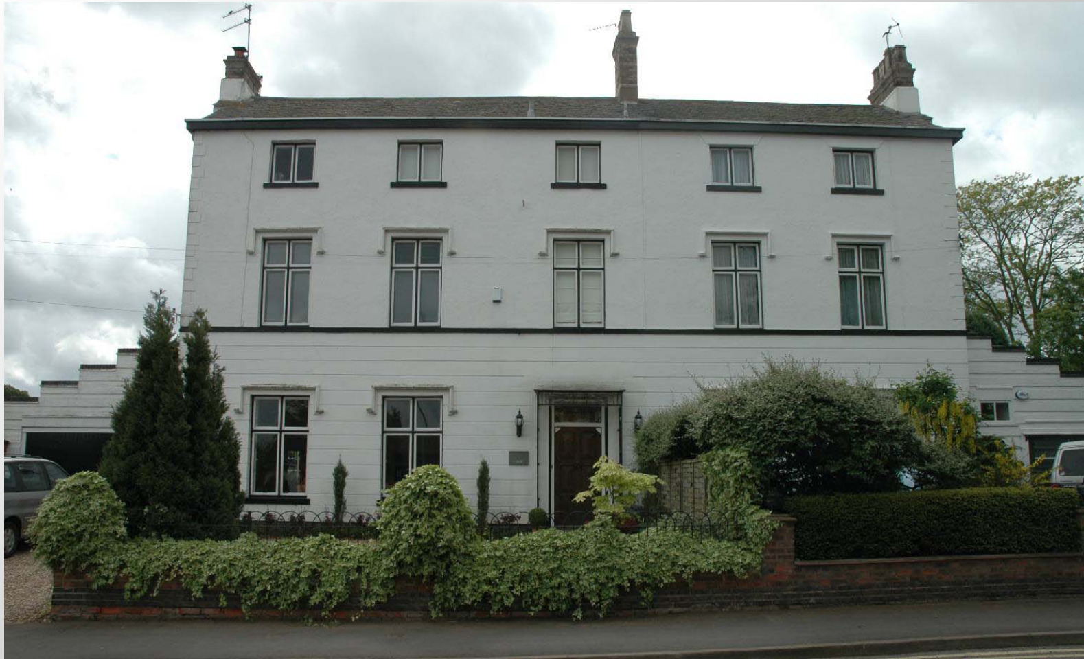
Variety of buildings reflecting the history