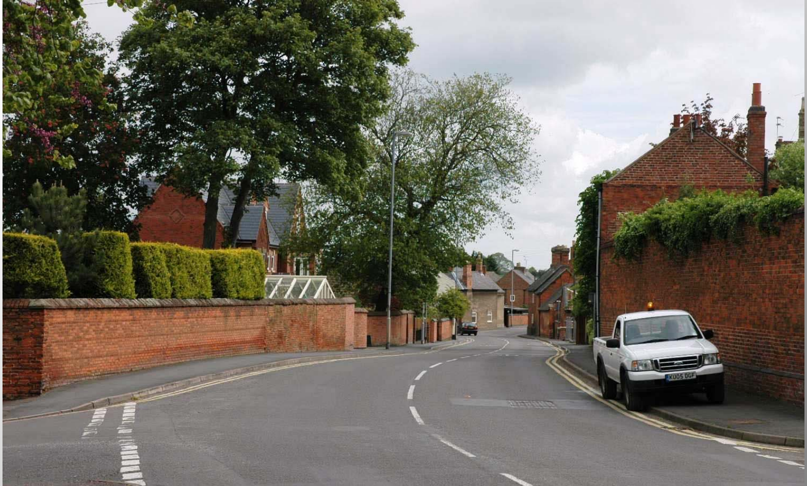
Winding mediaeval street