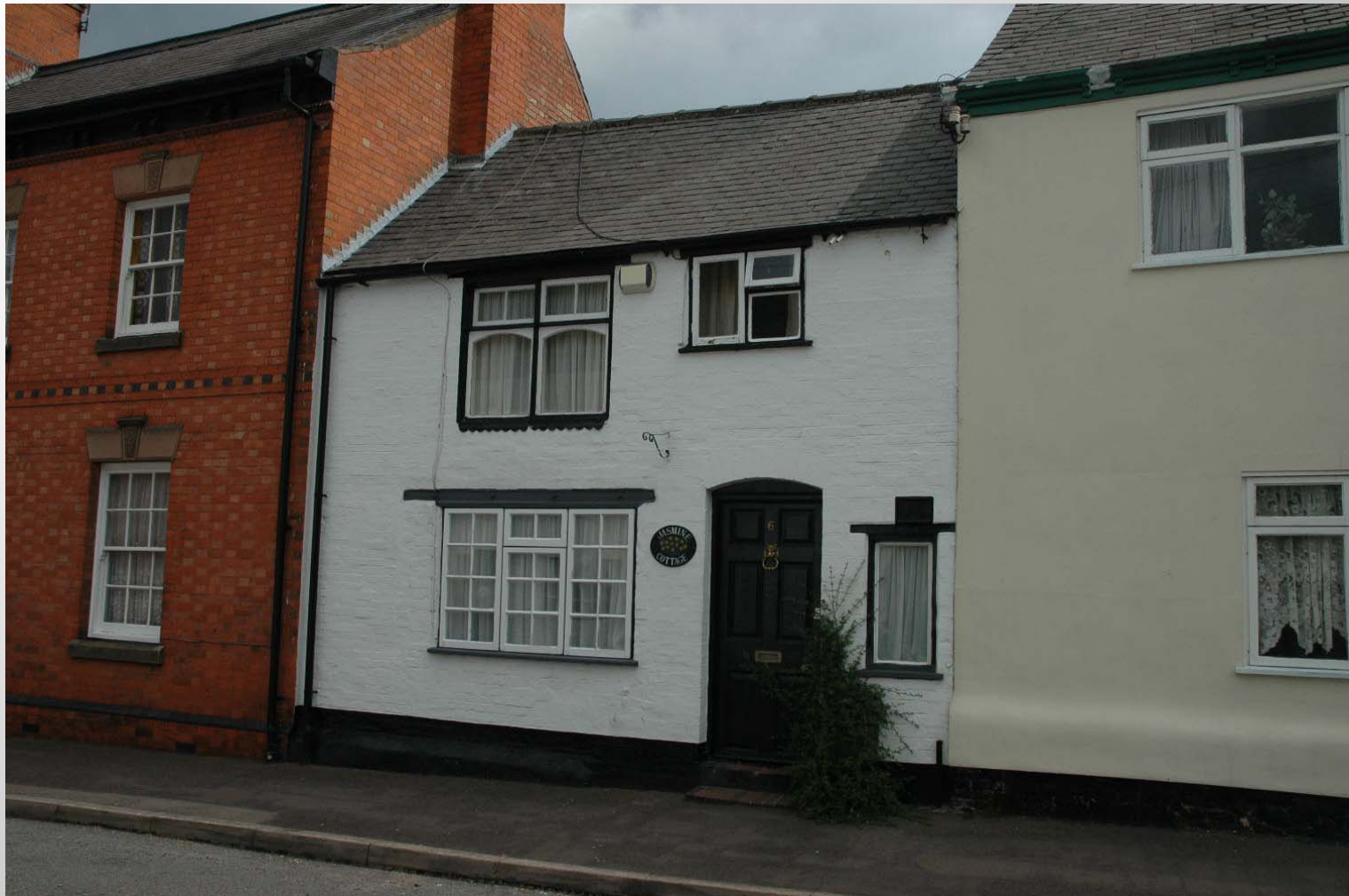
Variety of buildings reflecting the history