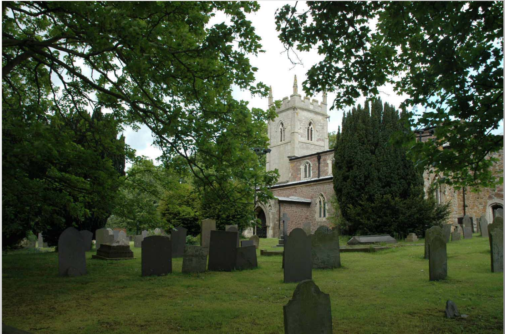
Trees and Green spaces