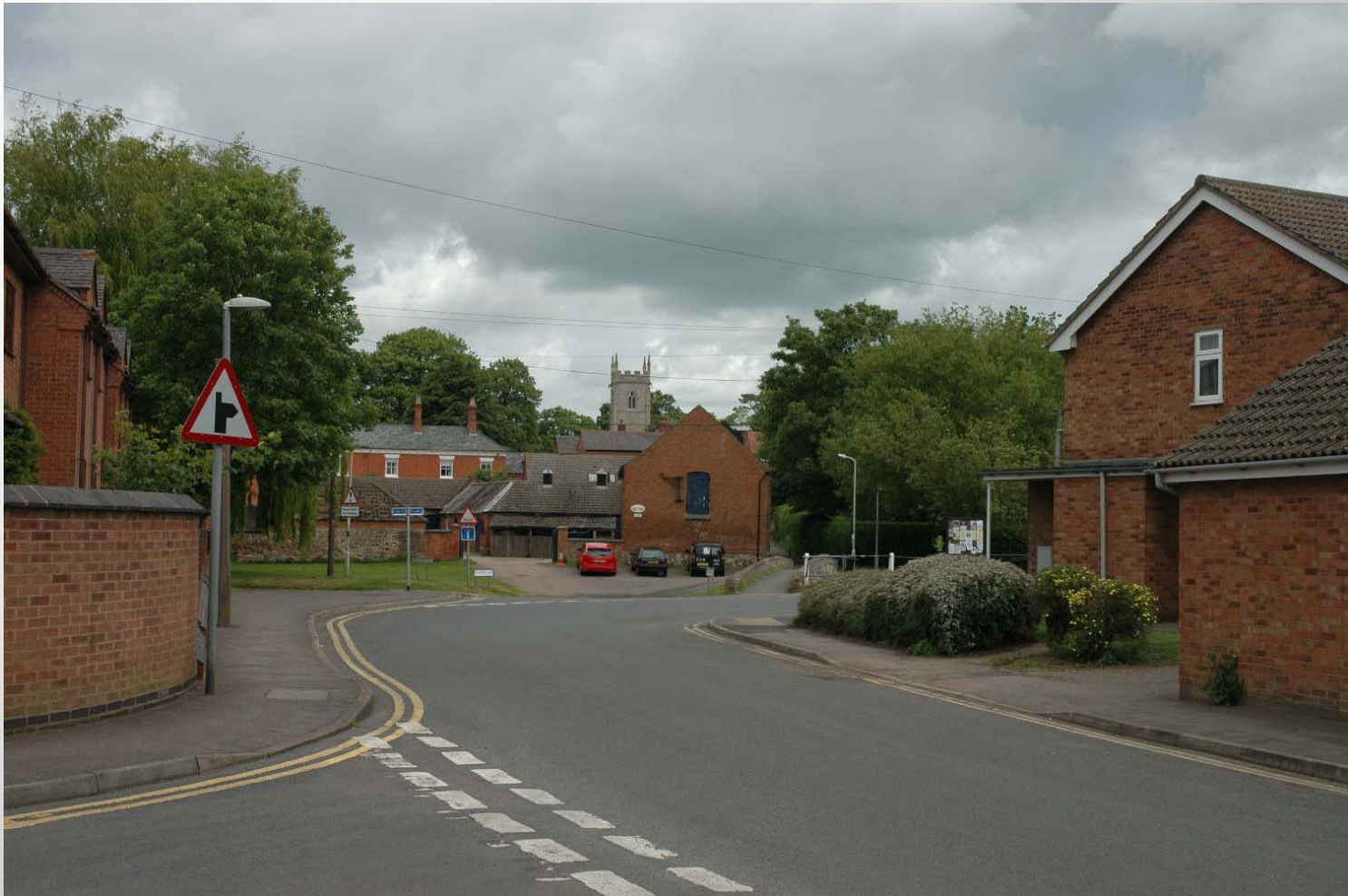
Openings in the streets