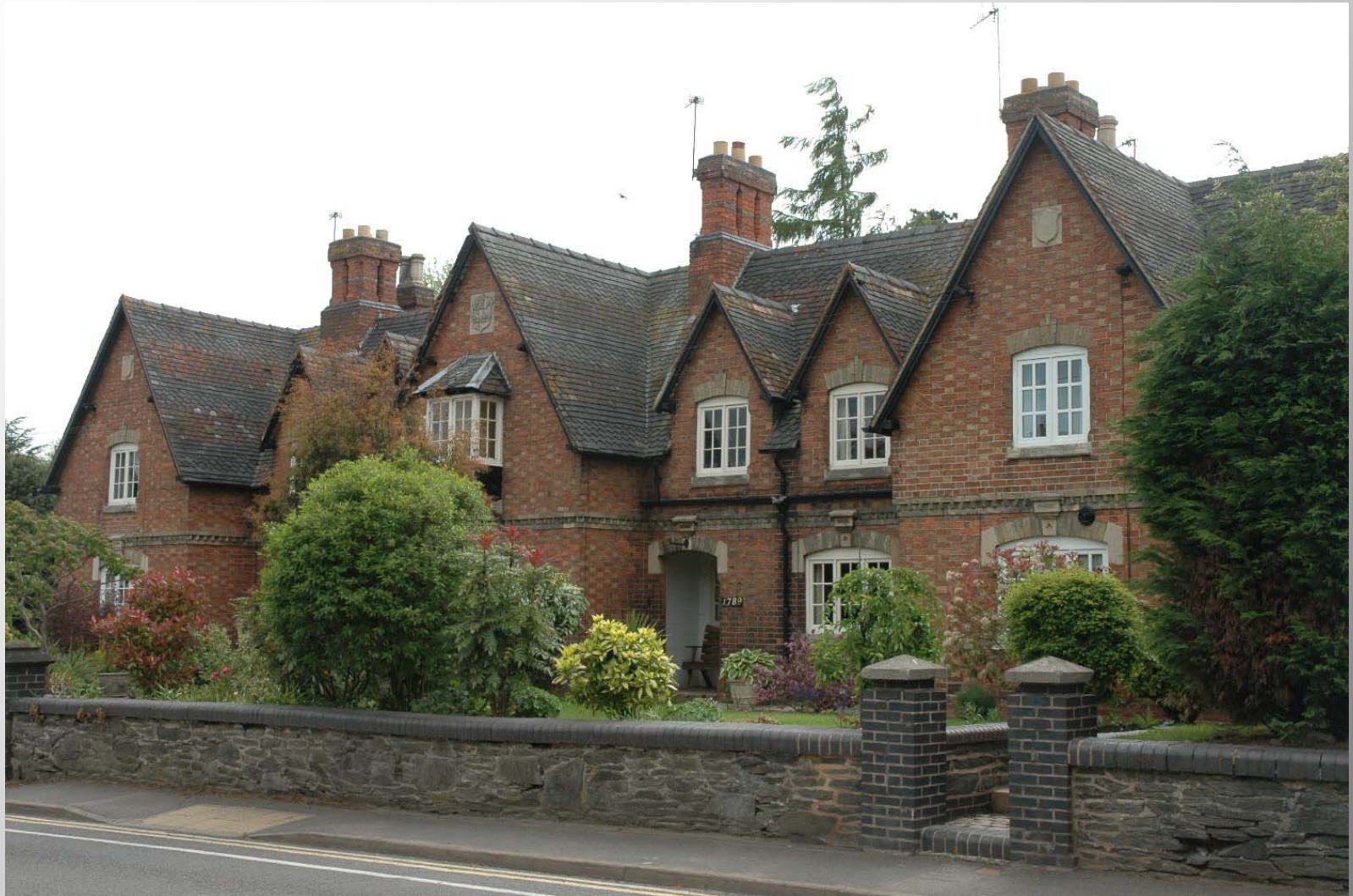
Variety of buildings reflecting the history