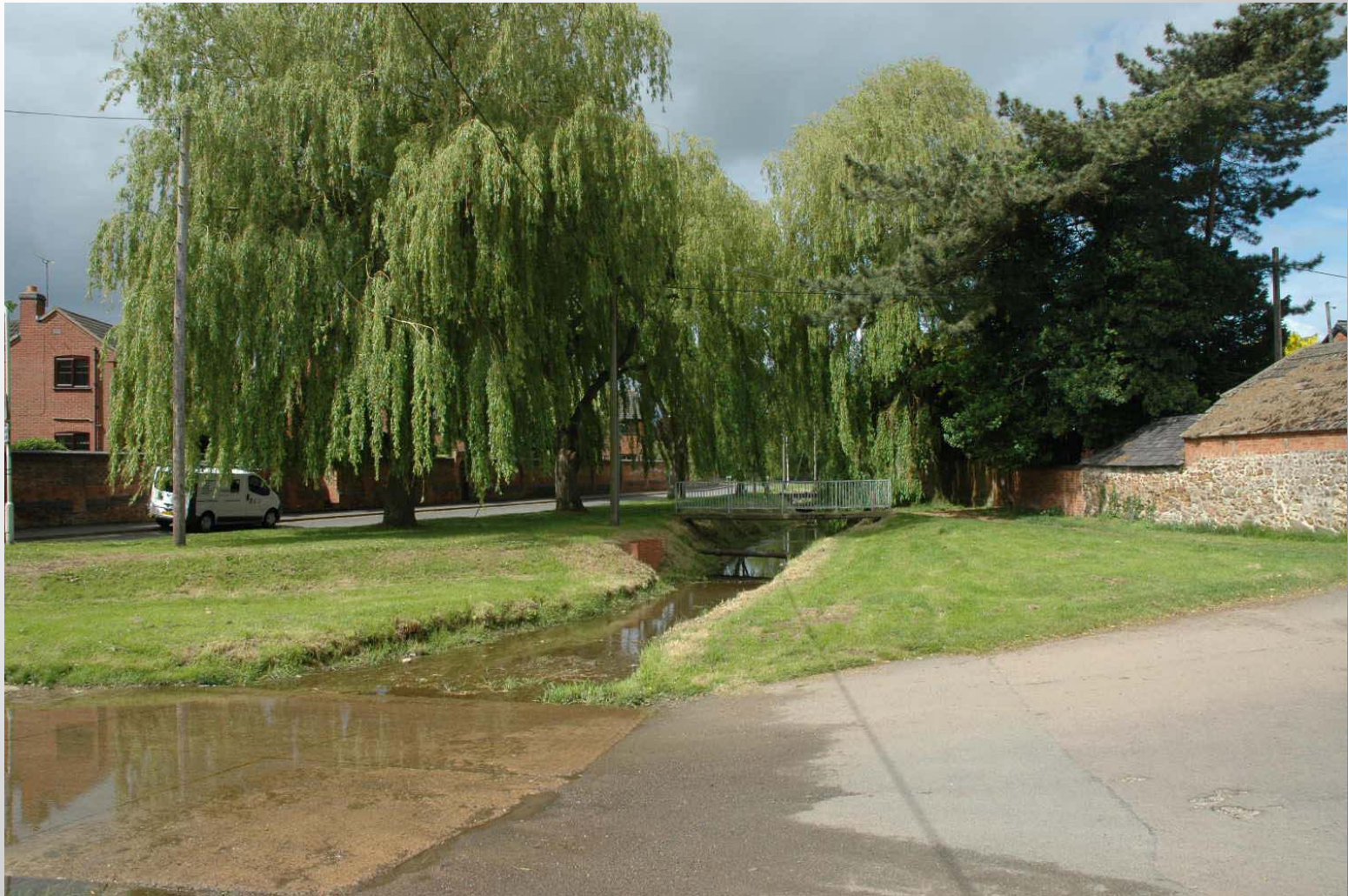
Trees and Green spaces