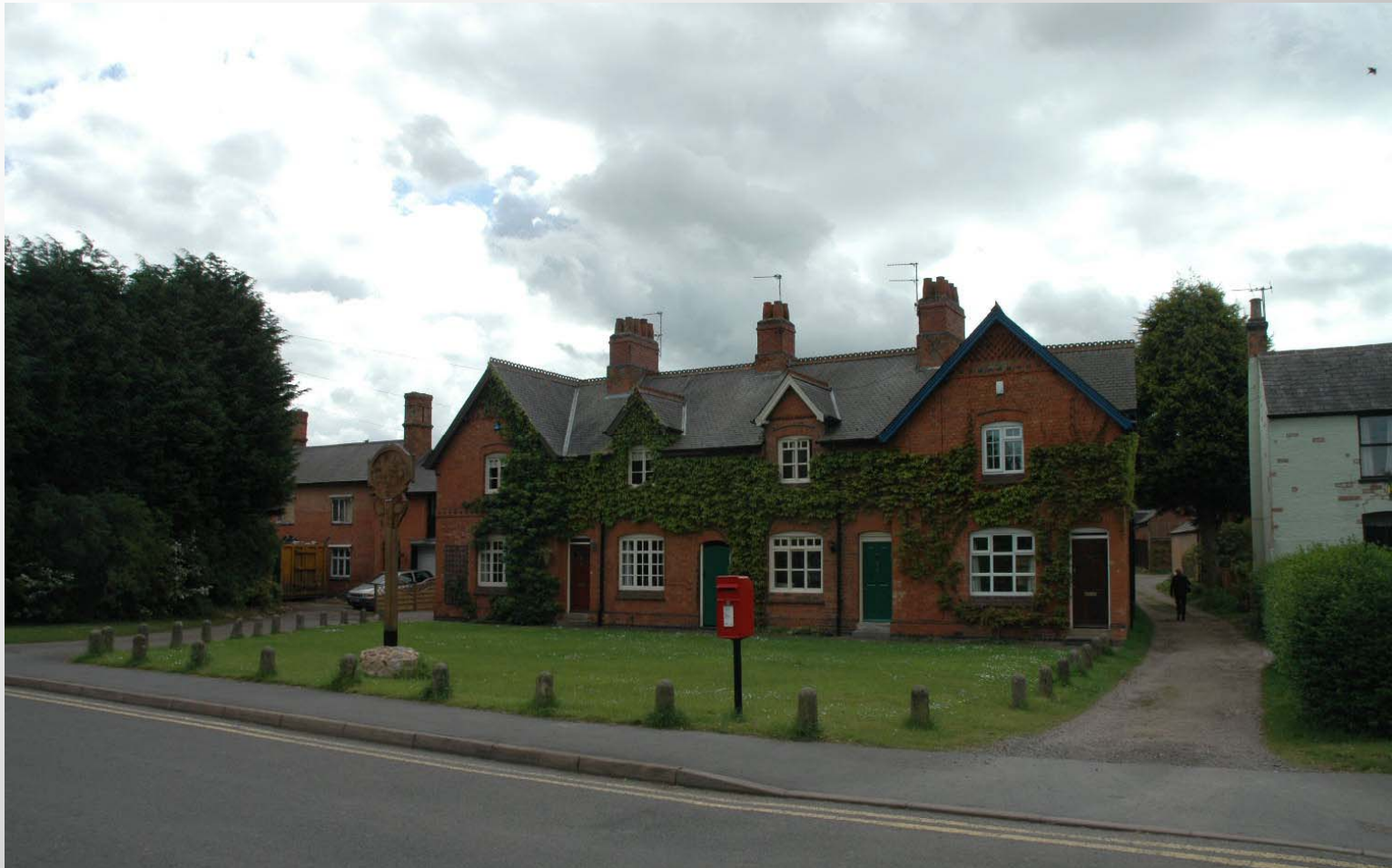
Trees and Green spaces