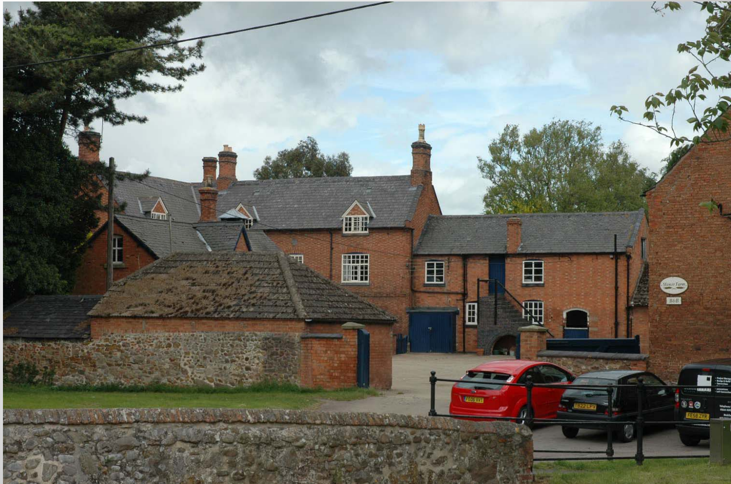
Variety of buildings reflecting the history