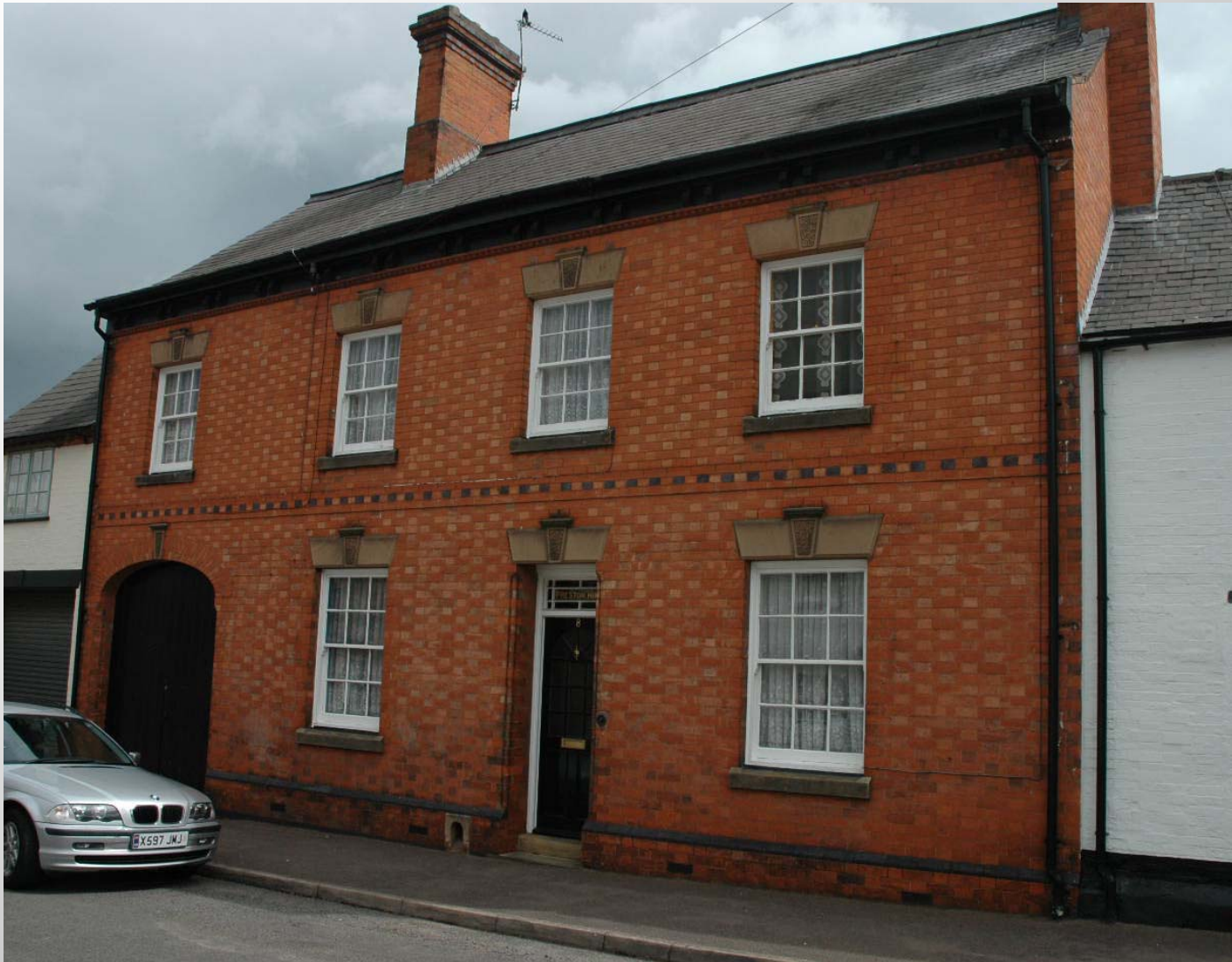
Slate roof, blue brick bands, stone window heads