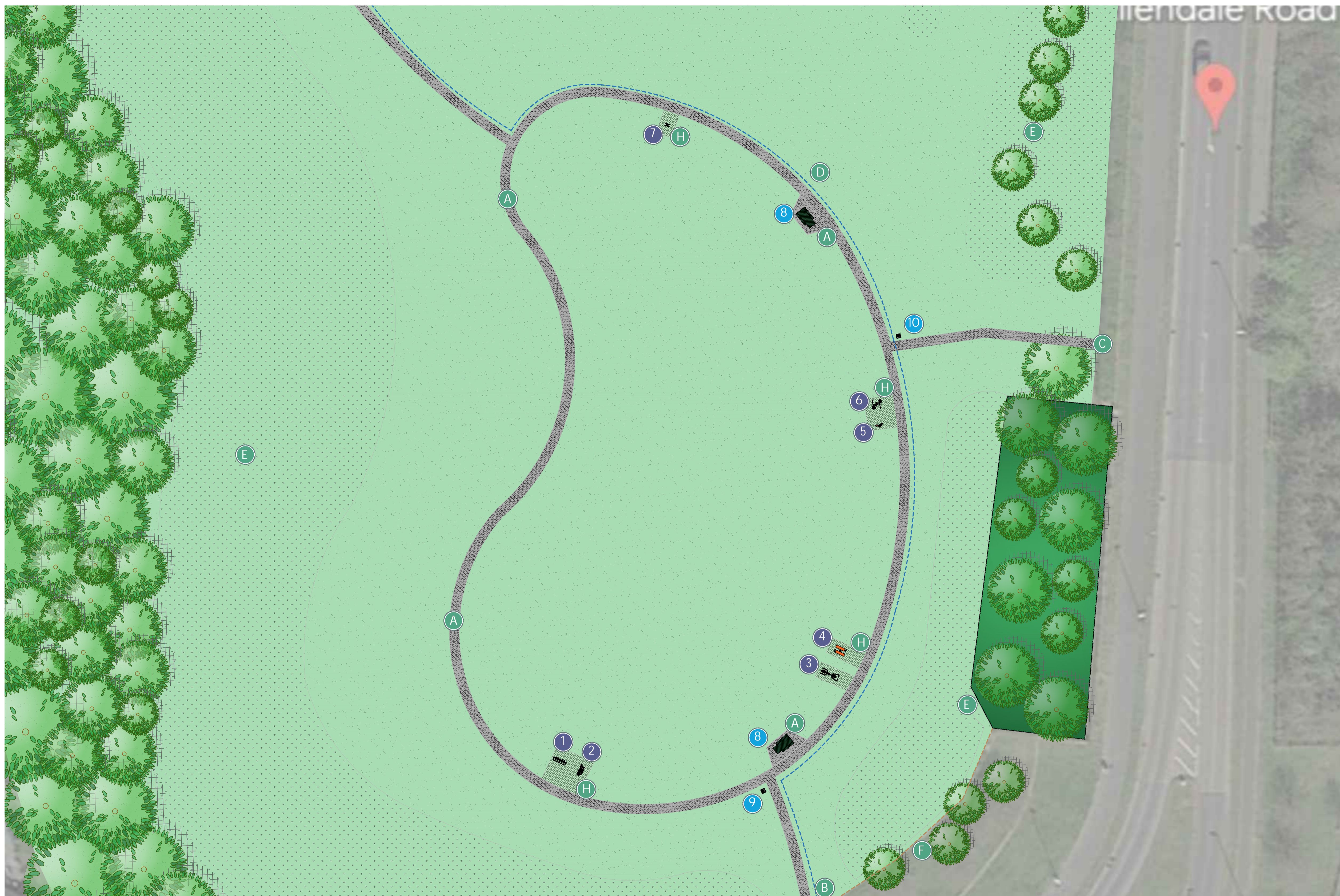
1 Sunshine Gym Double Health Walker Code: BX/SG 3008 2 Sunshine Gym Sky Stepper Code: BX/SG 3000 3 Sunshine Gym Combi Pull Down and Power Push Double Sit Up Bench Code: BX/SG 3001 4 Sunshine Gym Double Sit Up Bench Code: BX/SG 3001 5 Sunshine Gym Arm & Pedal Bicycle Code: BX/SG 3017 6 Sunshine Gym Double Slalom Skier Code: BX/SG 3002 7 Sunshine Gym Double Strength Challenger Code: BX/SG 3013 8 Broxap Garthdee Picnic Unit with Wheelchair Access Code: BX17 4016-2 9 Broxap Derby Standard Litter Bin 120L Code: BX45G 2550 10