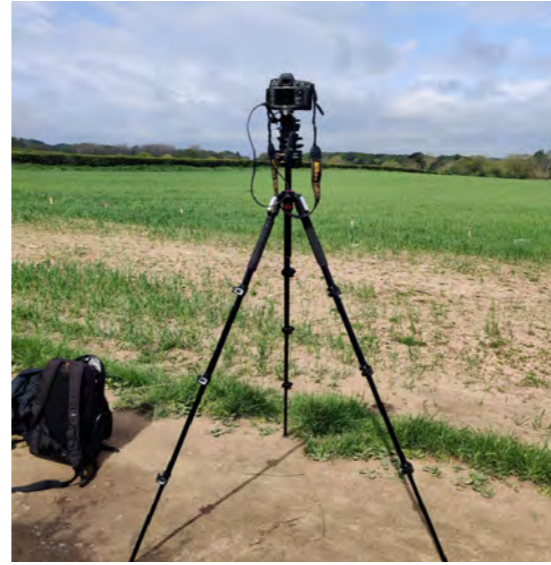
Viewpoint 11 Grid reference: 451834E, 317029.74N Ground Height: +71.92m AOD Camera Height: +73.52m AOD