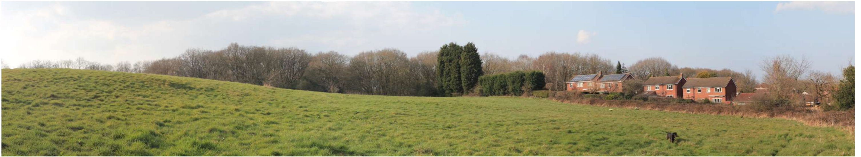
Context View A