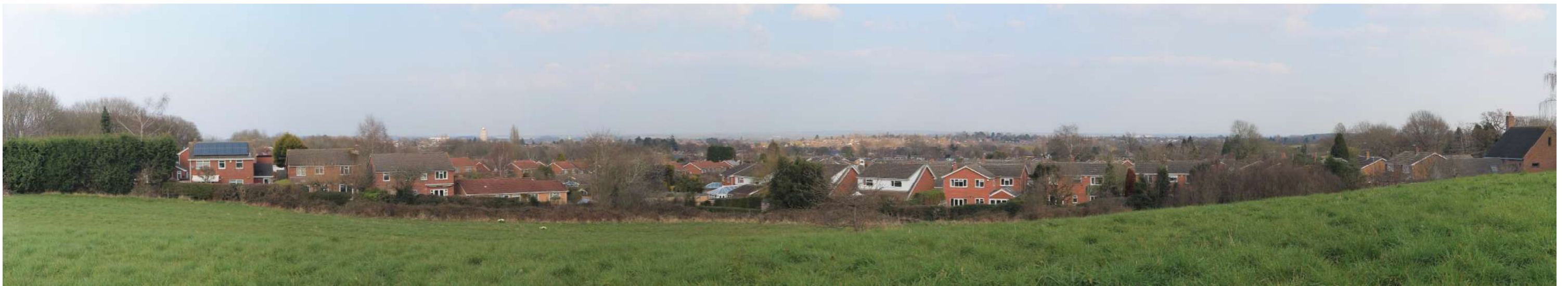
Context View C