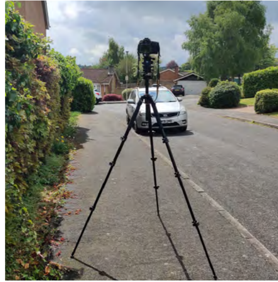
Viewpoint 06 Grid reference: 451050.63E, 317697.38N Ground Height: +77.06m AOD Camera Height: +78.66m AOD