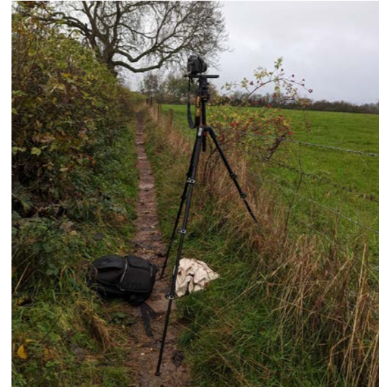
Viewpoint 12 Grid reference: 451542.67E, 316829.43N Ground Height: +97.6m AOD Camera Height: +99.2m AOD