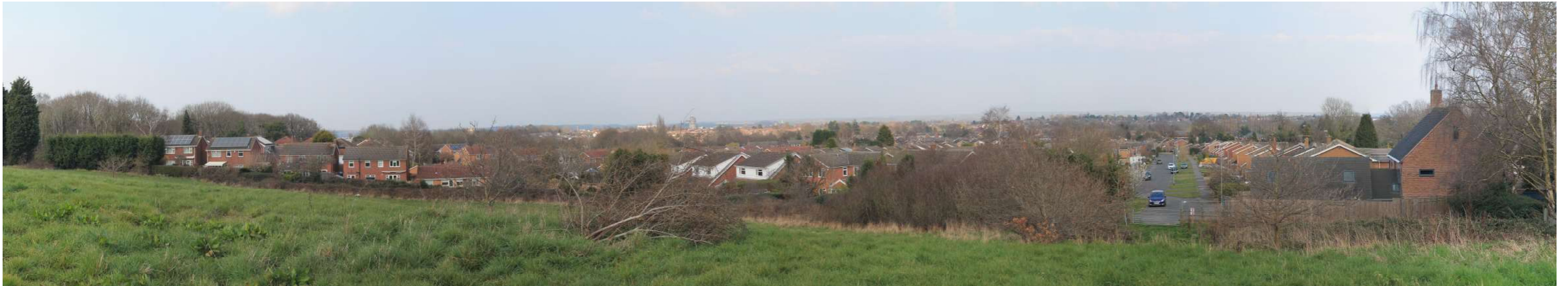
Context View B