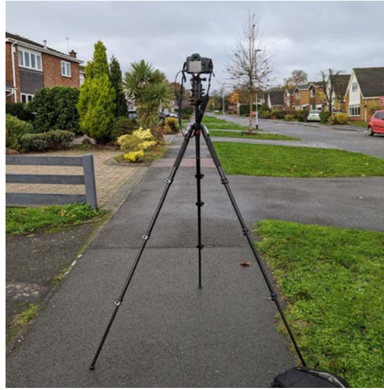
Viewpoint 02 Grid reference: 451186.73E, 317520.33N Ground Height: +73.08m AOD Camera Height: +74.68m AOD