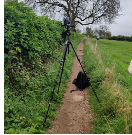
Viewpoint 12 Grid reference: 451539.55E, 316827.06N Ground Height: +97.82m AOD Camera Height: +99.42m AOD