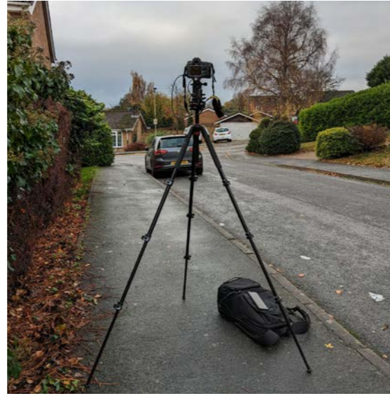
Viewpoint 06 Grid reference: 451049.44E, 317698.22N Ground Height: +74.83m AOD Camera Height: +76.43m AOD