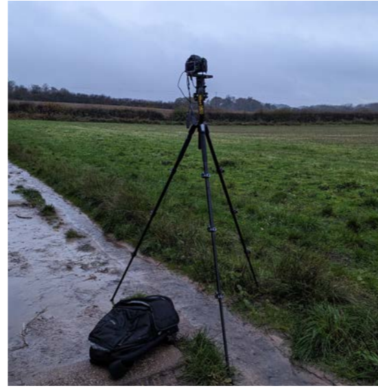
Viewpoint 11 Grid reference: 451834.2E, 317030.15N Ground Height: +72.12m AOD Camera Height: +73.72m AOD