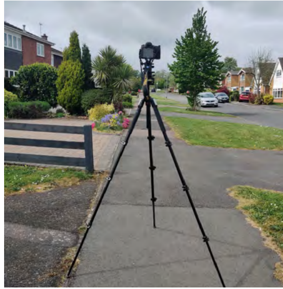
Viewpoint 02 Grid reference: 451186.63E, 317519.75N Ground Height: +72.98m AOD Camera Height: +74.58m AOD