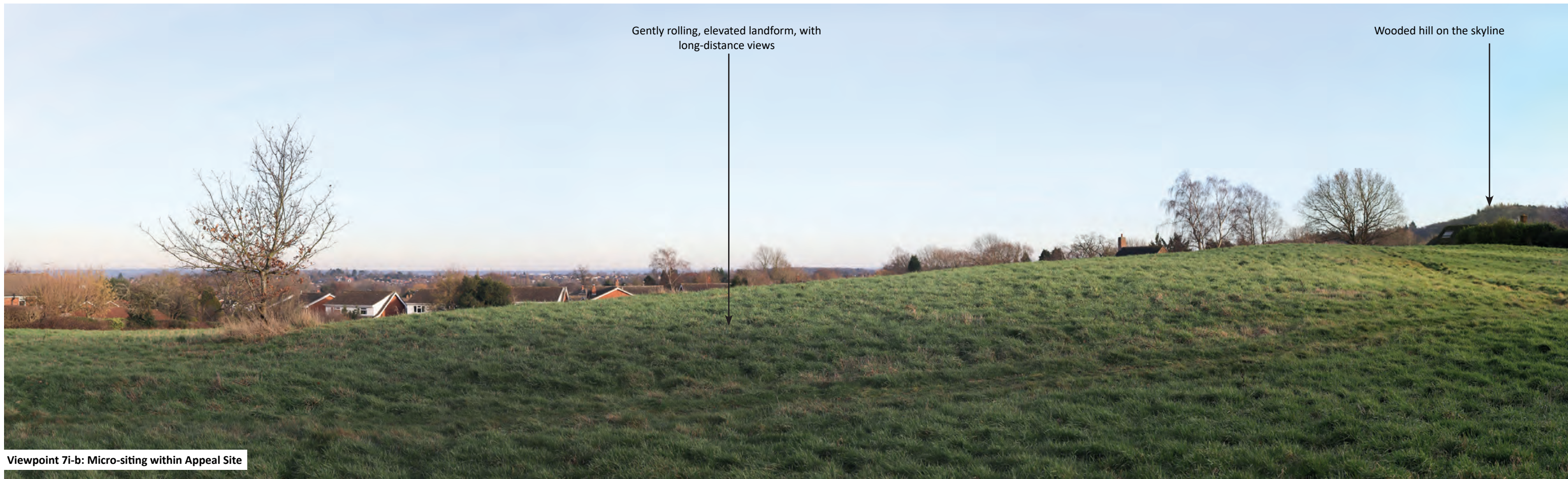
Viewpoint 7i-b: Micro-siting within Appeal Site

Grid Reference: E:450902, N:317581, Direction Of View: East Camera Elevation: 1.5m Above Ground Level. Distance From Nearest Edge Of Proposed Development Site: Within Site