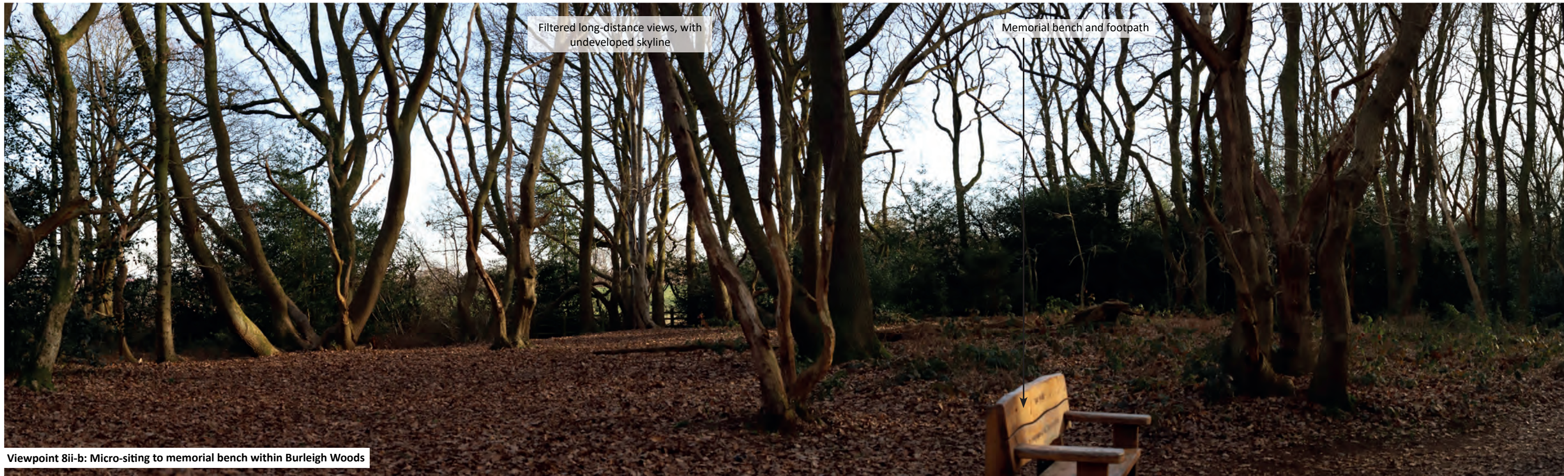
Viewpoint 8ii-b: Micro-siting to memorial bench within Burleigh Woods

Grid Reference: E:450842, N:317622, Direction Of View: North Camera Elevation: 1.5m Above Ground Level. Distance From Nearest Edge Of Proposed Development Site: 50m