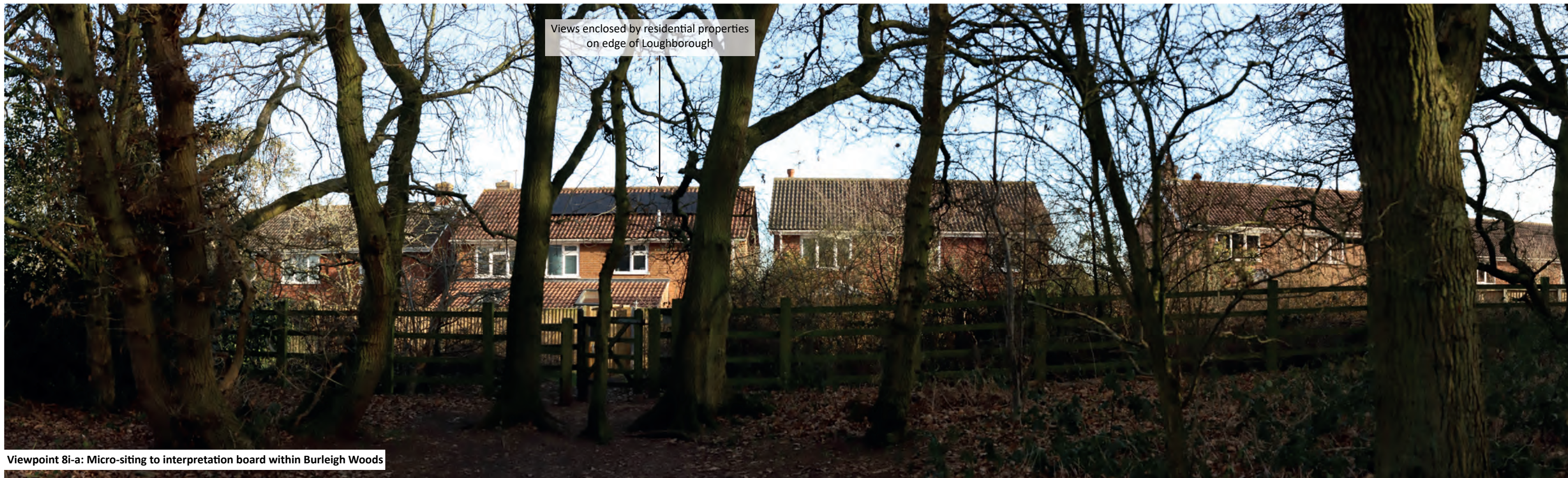
Viewpoint 8i-a: Micro-siting to interpretation board within Burleigh Woods

Grid Reference: E:451000, N:317773, Direction Of View: East Camera Elevation: 1.5m Above Ground Level. Distance From Nearest Edge Of Proposed Development Site: 0.16km