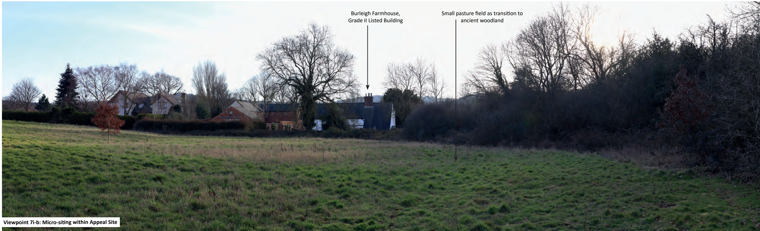
Viewpoint 7i-b: Micro-siting within Appeal Site

Grid Reference: E:450902, N:317581, Direction Of View: East Camera Elevation: 1.5m Above Ground Level. Distance From Nearest Edge Of Proposed Development Site: Within Site