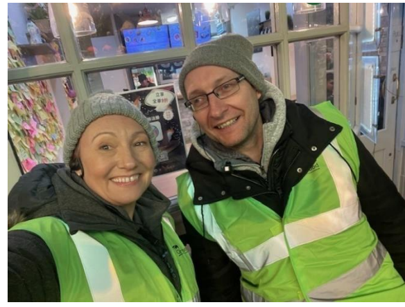
Over 50 food vendors were inspected across the two events.