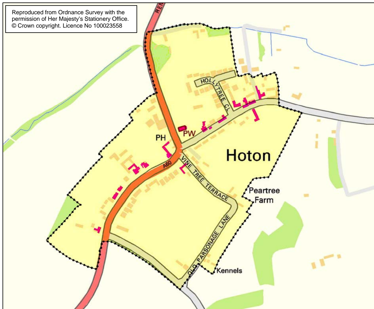
Current map of Hoton showing the extent of the Conservation Area and the listed buildings.

Hoton Conservation Area was designated in December 1978 and extended in January 1991. The original designation incorporated the main built part of the village. The extension was proposed in order to include the medieval site of the village, based on archeological evidence. Ultimately the whole village was included in the Conservation Area which now covers 22.2 Hectares.