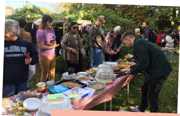
Judging the Bake Off