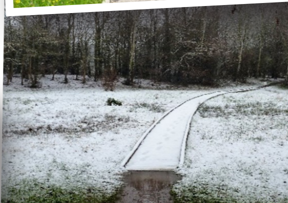
Top: The main walkway in June. Bottom: The same walkway in Feb.