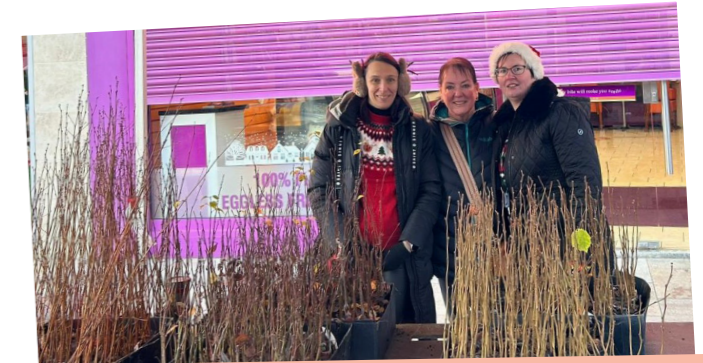
Officers from the council and idverde handing out free trees on Loughborough Market

The free trees were given out during National Tree Week (November 26 - December 4, 2022), an annual campaign by The Tree Council to mark the start of the tree planting season. The Council also ran a stall at Loughborough Market in early December where people could go along and collect a tree if they had missed the chance to apply online.