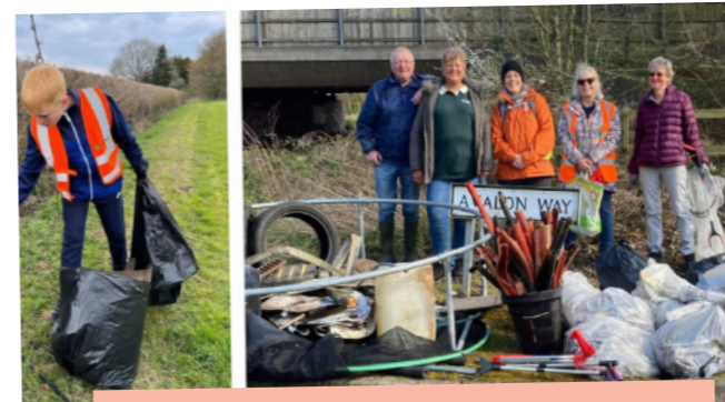
Litter picking groups

The Great British Spring Clean returned for its eighth year in 2023, from March 17 – April 2.