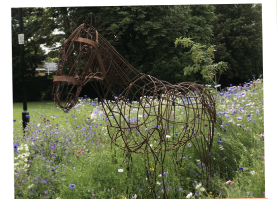
Songster's home amongst the wildflowers at Queen's Park

A project funded by Natural England has identified some biodiversity enhancement and the council are considering relaxing some of the mowing on some of our open spaces. It is expected that relaxed mowing of amenity grassland would lead to an increase in biodiversity, including pollinating insects.