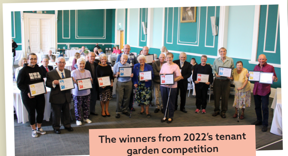
The winners from 2022's tenant garden competition

All entrants are invited to an award ceremony later in the year where entrants are able to meet other and staff from the council.