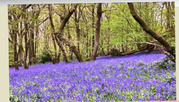
May's entry in the 2023 Loughborough in Bloom calendar

Each photograph used reflects both the correct time of the year and our all-year-round working. Individual community groups were invited to submit entries to be considered for the calendar, were chosen by a small panel of representatives. All of the calendars were sold and made a small profit for Bloom.