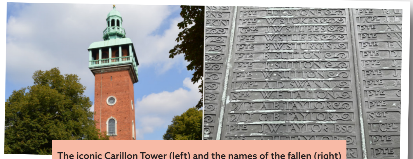
The iconic Carillon Tower (left) and the names of the fallen (right)

The Carillon Tower is the town's war memorial and around its base are the 478 names of servicemen who lost their lives in the First World War, Second World War, Korean and Falkland Wars and the conflict in Cyprus. You can find more out about the stories of those whose names are shown on the side of the Carillon Tower by visiting the Carillon Museum roll of honour at www.loughborough-rollofhonour.com .