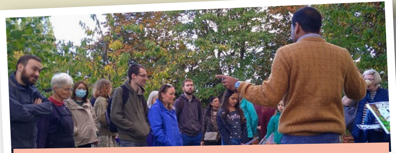
An explanatory talk, at LAGS allotment, during the University Fruit Routes event.

Some years ago, while congratulating us on the number of local IYN schemes, Judges asked if it would be possible to get them working together. We worked hard on that and now more than half of our community Groups work with, or alongside, at least one and often several, other groups. An excellent example is the joint seed swaps and plant stalls by Transition Loughborough, LAGS, Fearon Hall, Incredible Edible and Rectory Wildlife Garden. In addition, Loughborough Lions provide Volunteers to work at the local Hospital and Rainbows Hospice plus Glebe House and Men & Women in Sheds produce all manner of Bird & Bat Boxes, Insect Houses and Planters for various other groups.