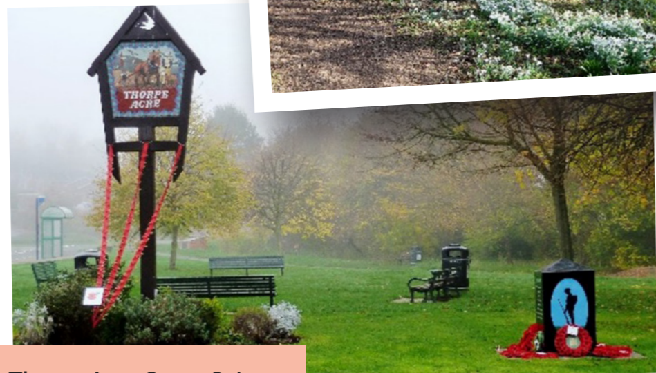
Top: Snowdrop walk through Thorpe Acre Green Spinney. Bottom: Remembrance display on the Green.