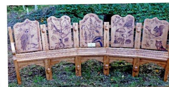
Handcrafted by Charnwood Men & Women in Sheds 2022 In partnership with Charnwood Arts & Charnwood Forest Geopark Funded by The National Lottery Community Fund

The volunteer gardeners also maintain the planters outside John Storer House on Wards End, near to Queens Park and enter It's Your Neighbourhood each year.