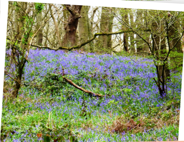
Beautiful bluebells at Burleigh Wood