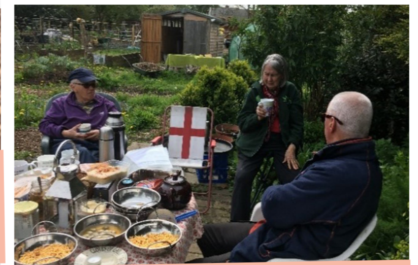
Volunteers on the Transition Allotment, enjoying a brief rest during the "Good to Grow" National Day of Action