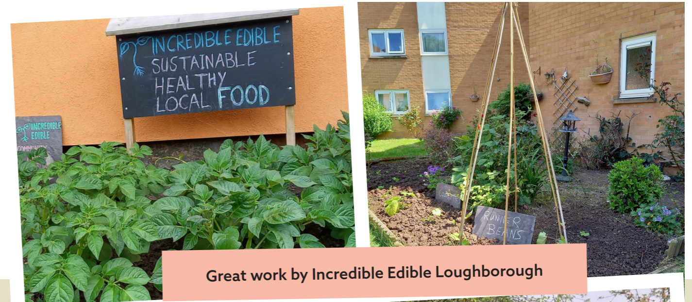
Great work by Incredible Edible Loughborough

They hold a number of events throughout the year, and you can find out more on the IE Facebook page at www.facebook.com/groups/368547475219206 .