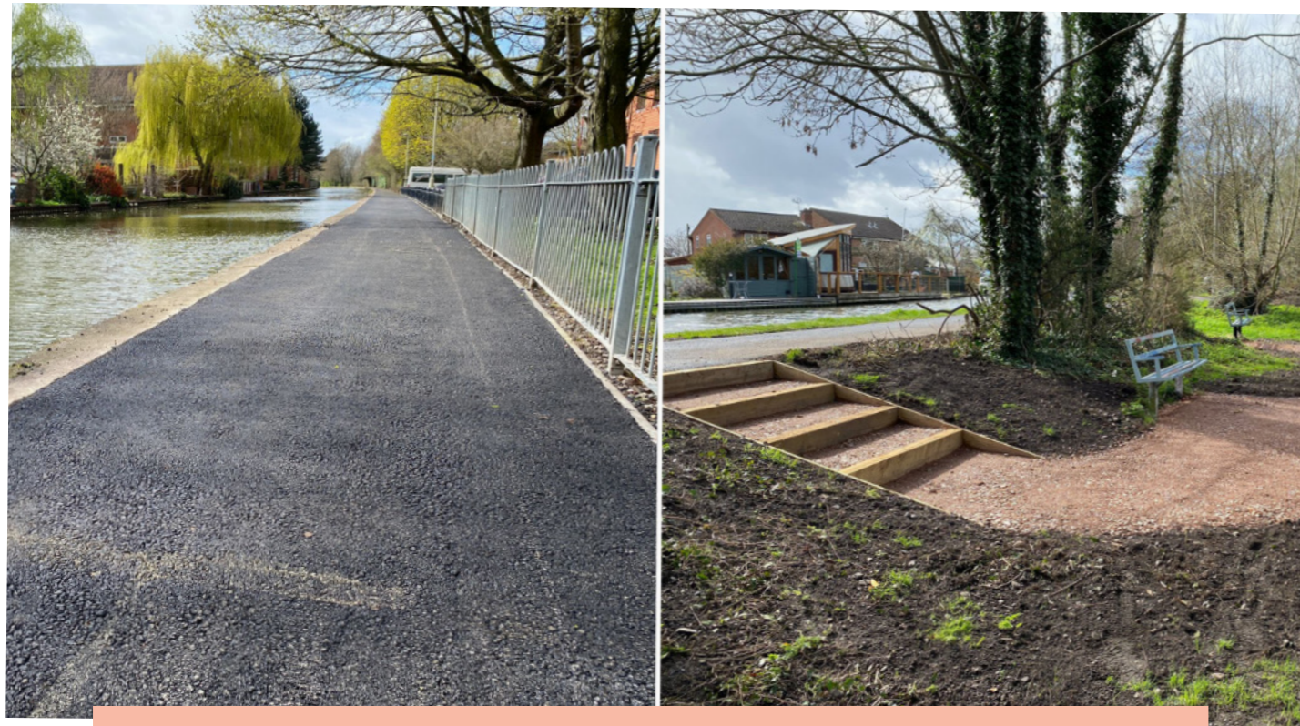
The new and improved pathways of the Grand Union Canal in Loughborough

With research showing that time spent by water can help people feel happier and healthier, and with more people looking for a local escape on their doorstep, the works make it easier and more appealing for people to get out and explore the local canals and other routes on their doorstep.