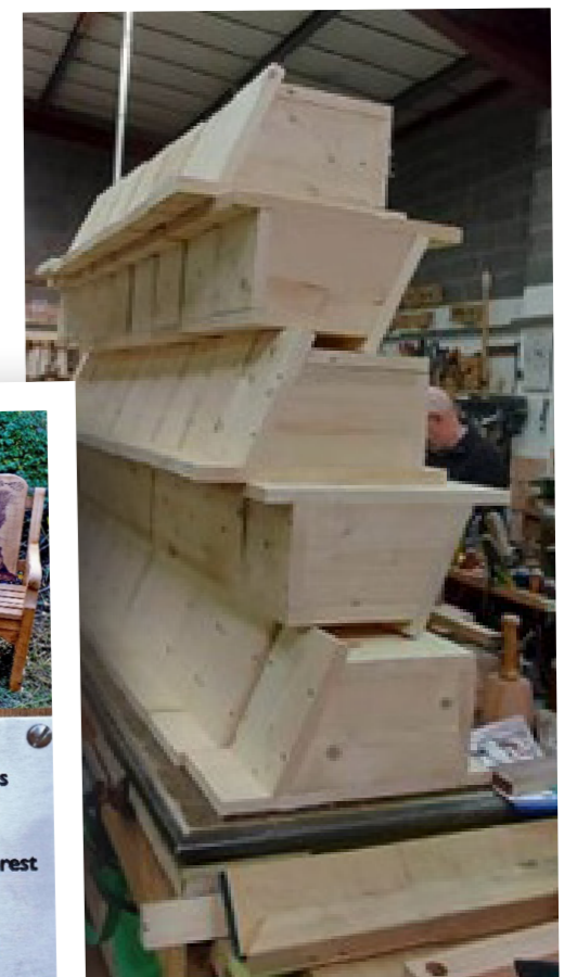
Left: The meticulously carved bench produced for Loughborough Outwood's Right: Fifty bird boxes produced for Watermead Country Park.