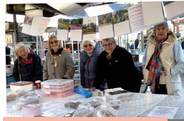
Cake stall at Loughborough Market