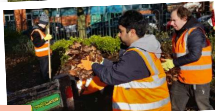
Volunteers from Leicester College in action