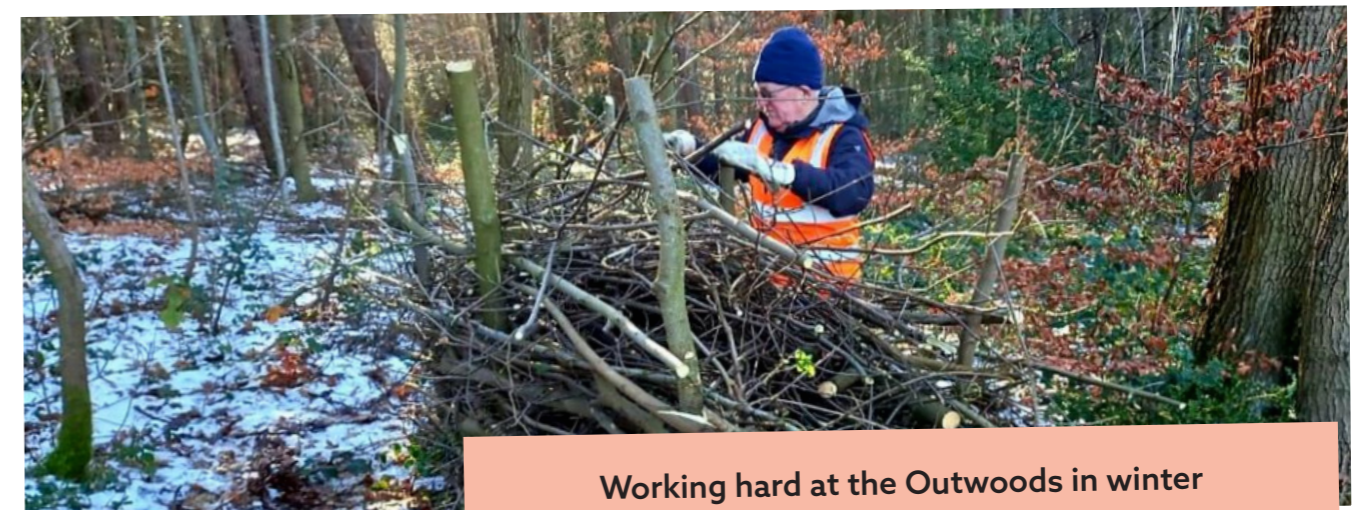
Working hard at the Outwoods in winter

All Green Gym sessions throughout January have been continuing with the removal of sycamore within the woodland. Due to its invasive power and rapid propagation from seed, this task is highly important to reduce potential smothering of the woodlands native healthy species. As part of the clearing processes, habitat piles have also been created to encourage shelter and a sustainable food supply for the woodlands wildlife.