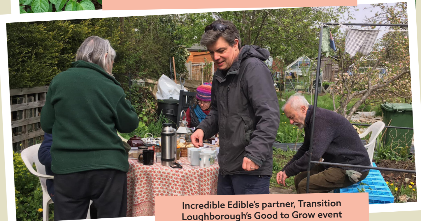
Incredible Edible's partner, Transition Loughborough's Good to Grow event