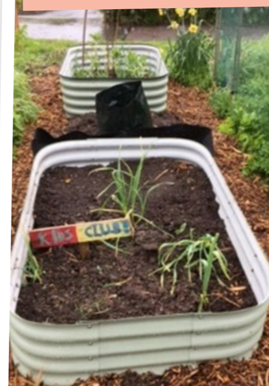
Metal Raised beds, donated to LAGS by the family of a local gardener who recently died, and installed by parents and children of the active local Home Education Group.