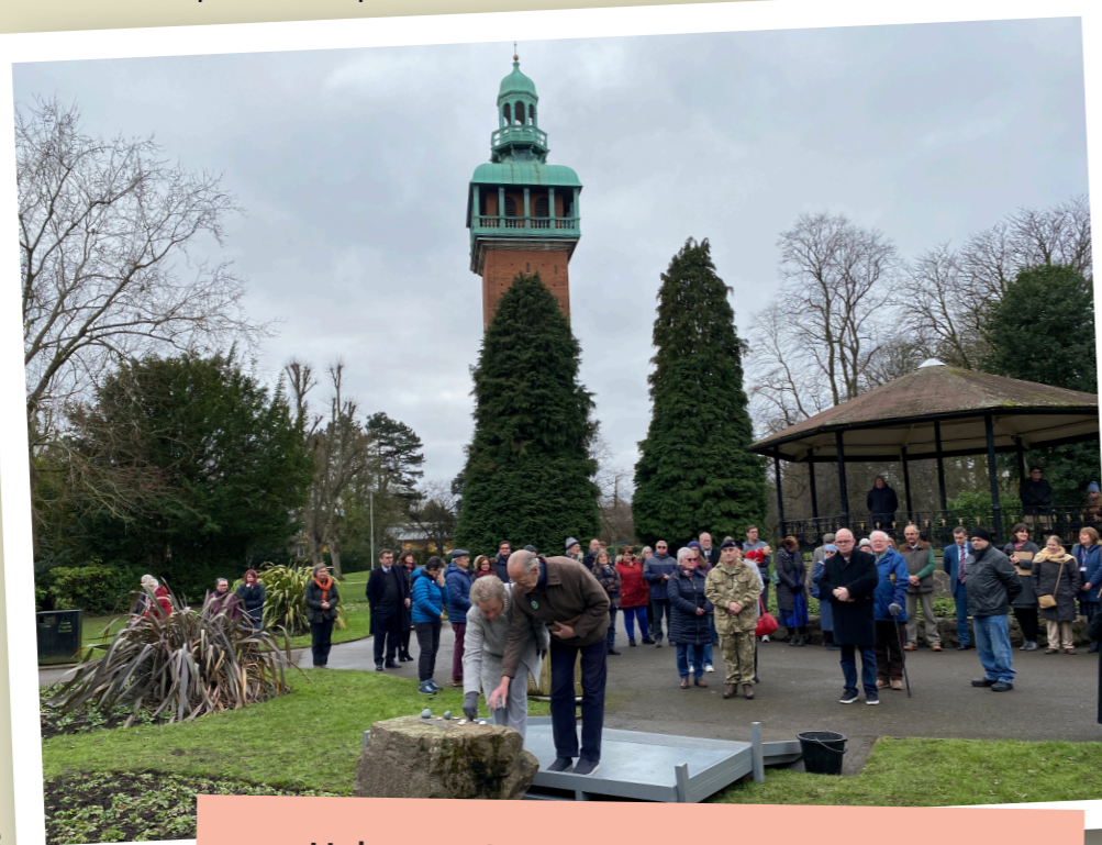
Holocaust Memorial Day in Queen's Park

idverde were also delighted to welcome students from Leicester College back to Queens Park for another year as part of their student placement/work experience programme. The students will work within the park every fortnight throughout the academic year.