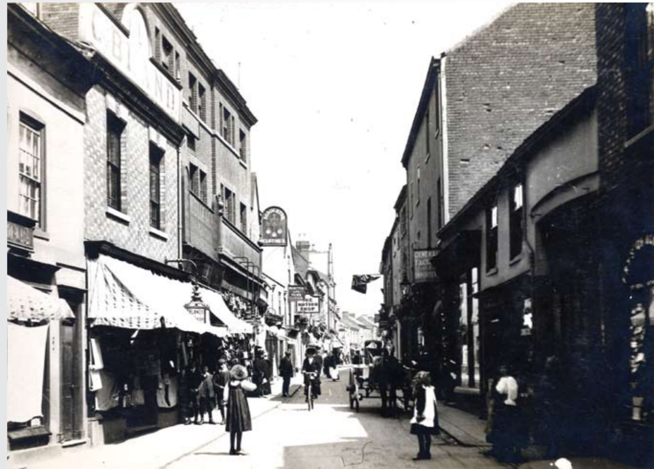
Church Gate 1890s

These important sites and buildings are also shown on Plan 18. The Council will seek to ensure that these buildings are retained and re-used wherever possible. Where they fall within sites identified for development, redevelopment or improvement appropriate uses will be sought to ensure a positive and continuing role for the buildings.