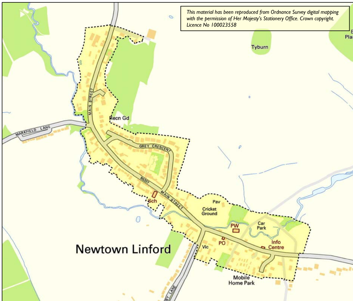
Current map showing the village and the Conservation Area